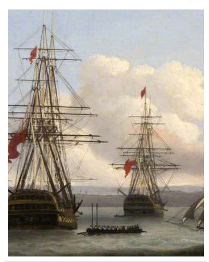
The Exile's Departure This detail of Thomas Luny's painting shows Napoleon being transferred from the Bellerophon to the Northumberland