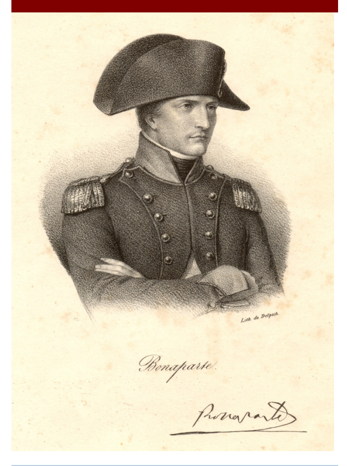
Lithographic print of Bonaparte and signature

On Sunday 18th June 1815, the final, decisive battle in the Napoleonic wars was fought at the small town of Waterloo, just south of Brussels in Belgium.