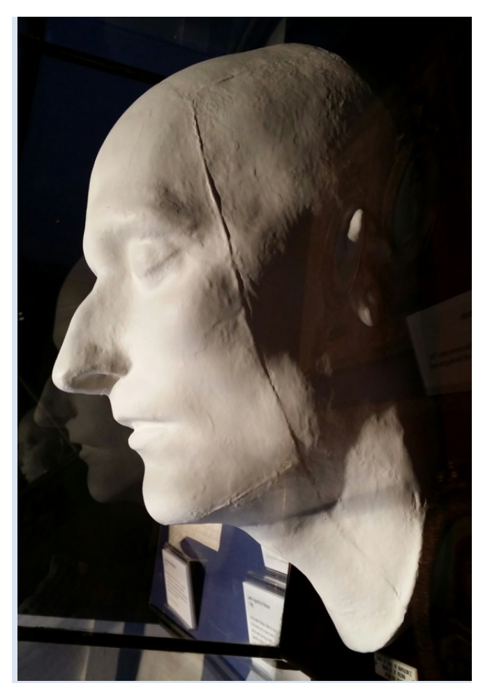
Death Mask of Napoleon

Until the details of Napoleon's exile could be finalised, Bellerophon sailed for Plymouth, whose more secure harbour within the vicinity of the Plymouth naval base afforded a more escape-proof location. However, the change of location had the drawback of attracting even more attention than in Torbay. They came in yachts, fishing vessels and any row boat that could be had, with one contemporary estimate calculating ten thousand sightseers gathered around Bellerophon , including naval officers and fashionable ladies dressed in their Sunday best.