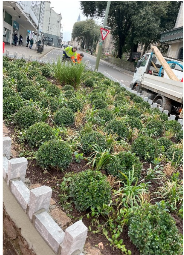
Work carried out by SWISCo on raised beds in Castle Circus has made a huge difference to the area

funding has kick-started the change needed and we are working with partners and communities to manage the complex challenges that exist.