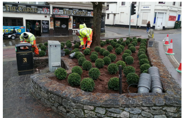
Clean and green: Photos show before, during and after work carried out in Castle Circus