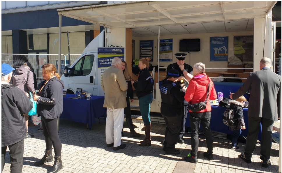
Proving popular: A 'pop-up cop shop' used during Op Loki attracted lots of interest

Engagement with local communities was high, with over 4,000 members of the public spoken to over the four weeks,