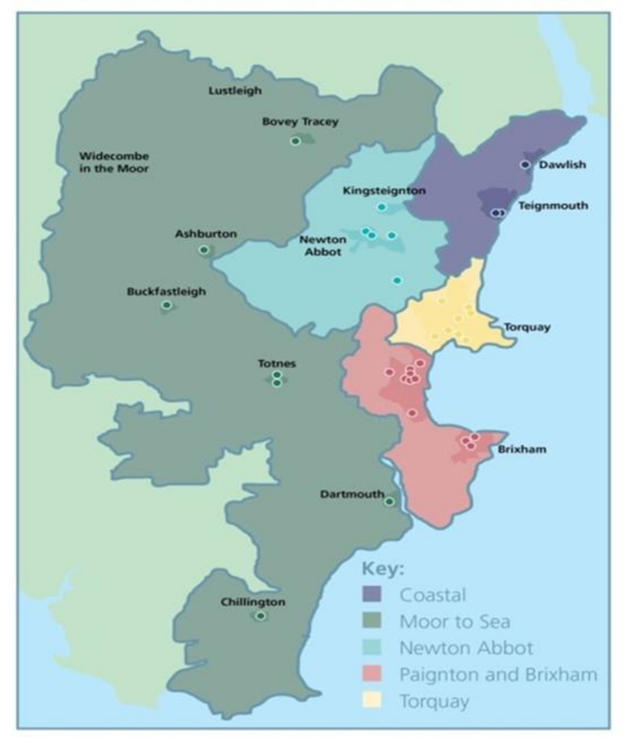
South Devon and Torbay Clinical Commissioning Group localities