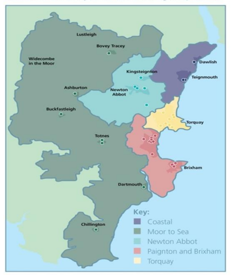
South Devon and Torbay Clinical Commissioning Group localities