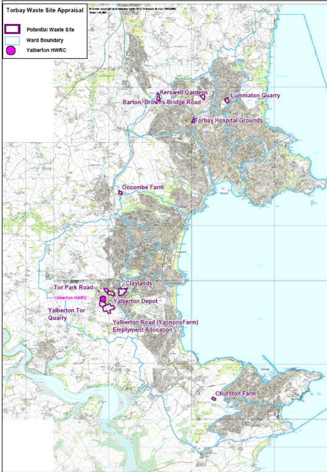
Figure 2.1: Location of Potential Waste Sites Identified for Appraisal