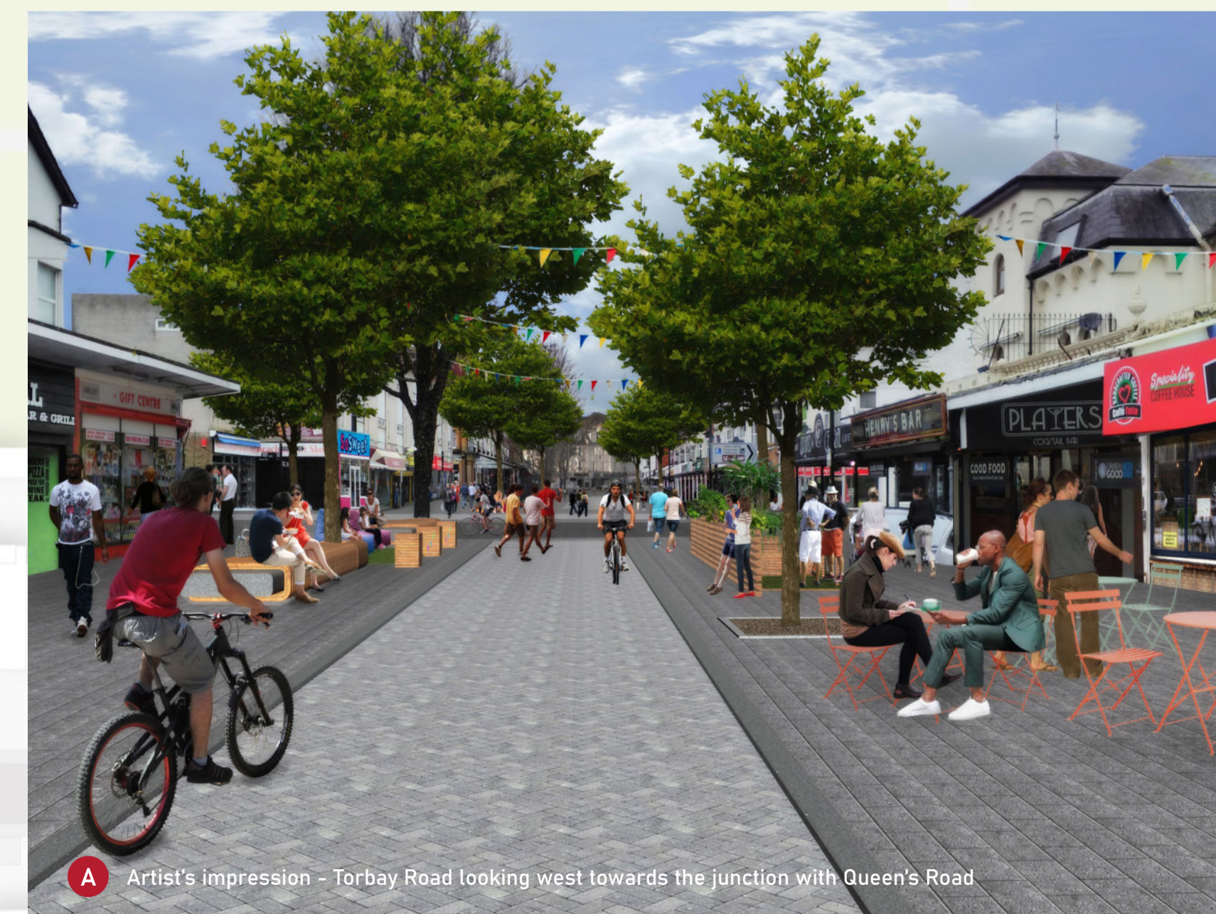
A Artist's impression - Torbay Road looking west towards the junction with Queen's Road