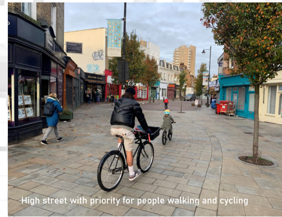
High street with priority for people walking and cycling