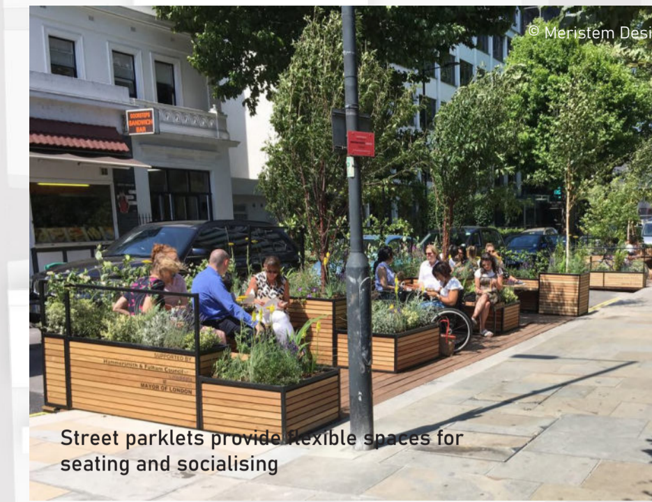
Street parklets provide flexible spaces for seating and socialising