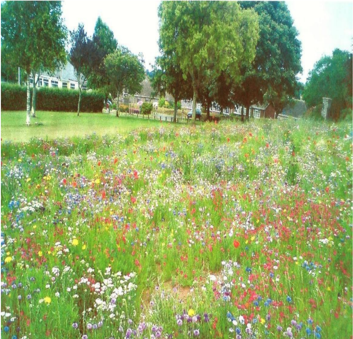
E4 – 11: St. Mary's Park Wild Flower Meadow.

E4 – 11: St Mary's Park. Adjoining the Higher Brixham Conservation Area, commanding panoramic views across the town towards the sea, this much-used park is the most important recreational area in Higher Brixham. Comprising sports field, bowling club, tennis courts and outdoor exercise equipment, it is used by members of the community of all ages. It also hosts the annual Hap'nin music festival, a well-established community organised event that could not be sited elsewhere.