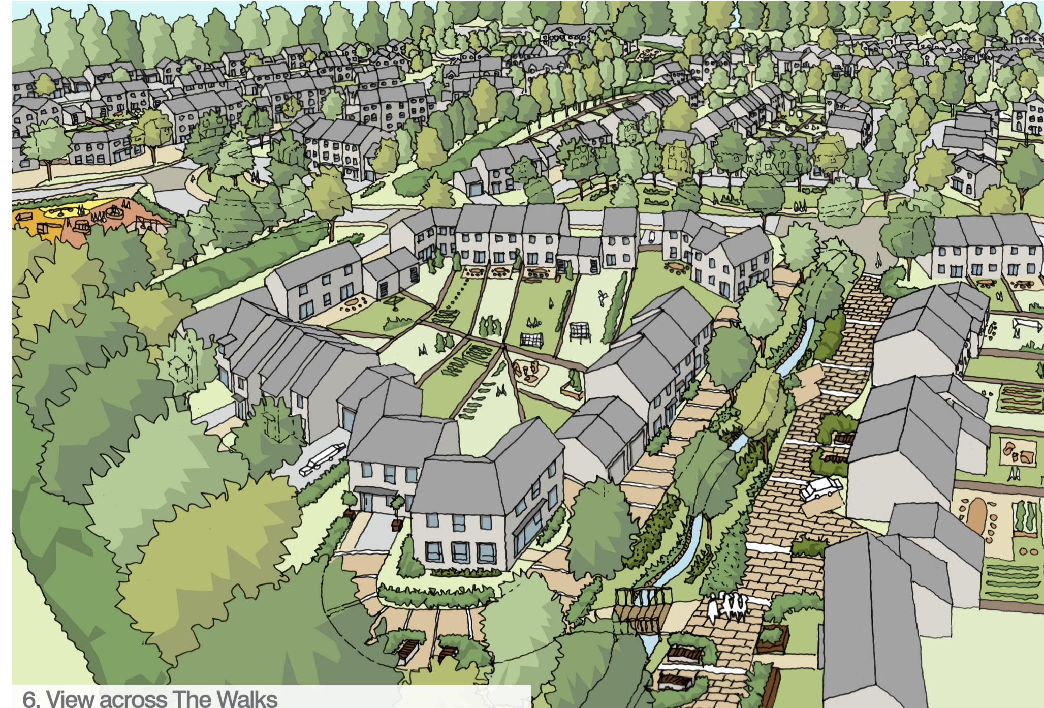
6. View across The Walks