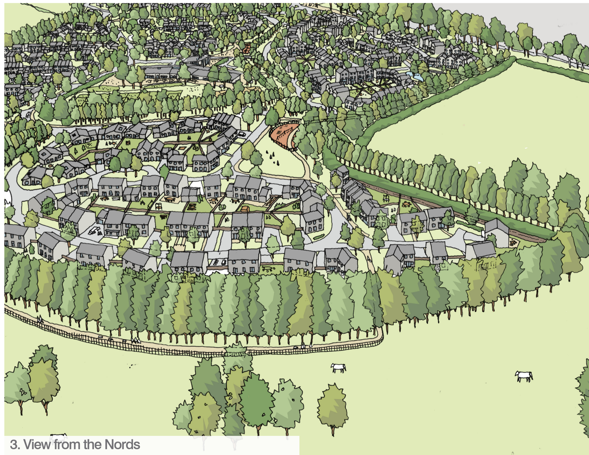
3. View from the Nords