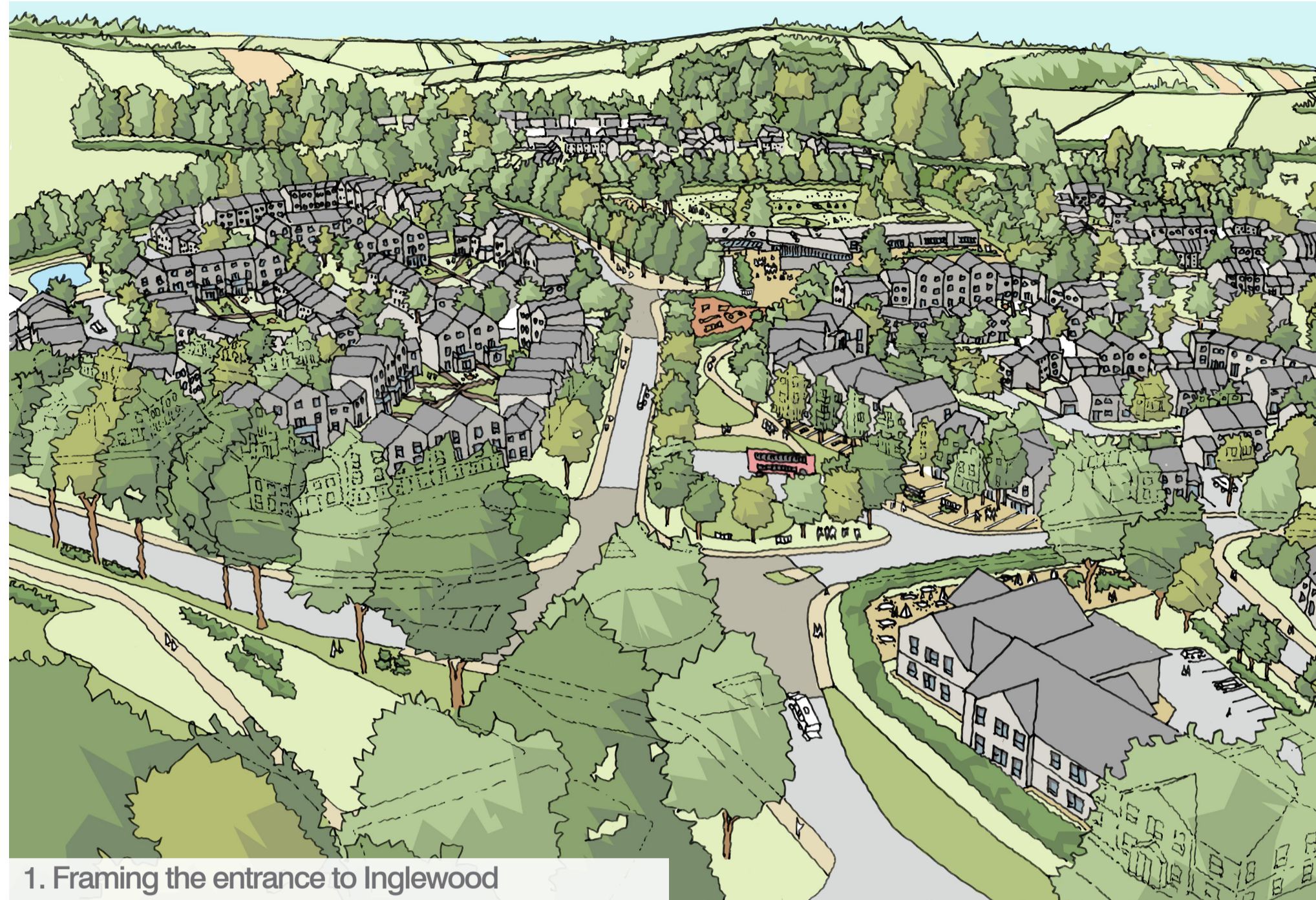
1. Framing the entrance to Ingleswood