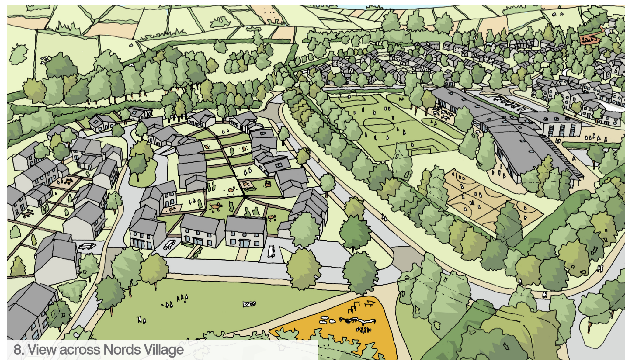
8. View across Nords Village