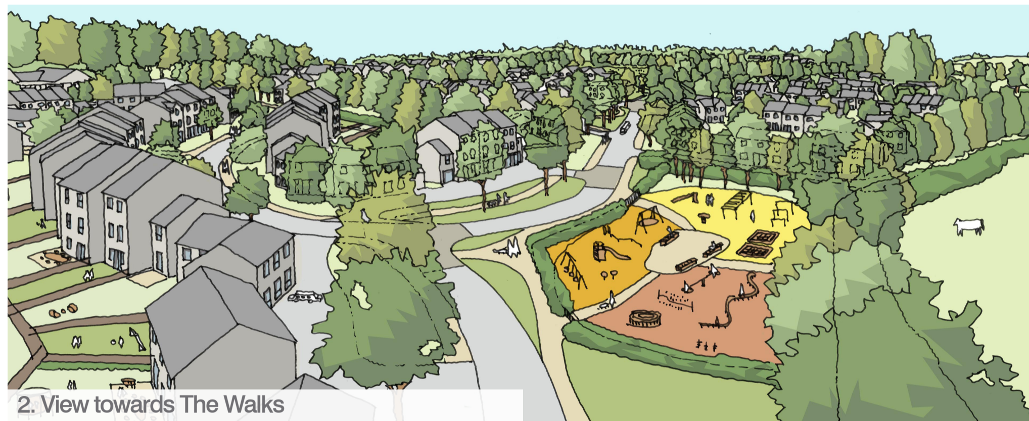
2. View towards The Walks