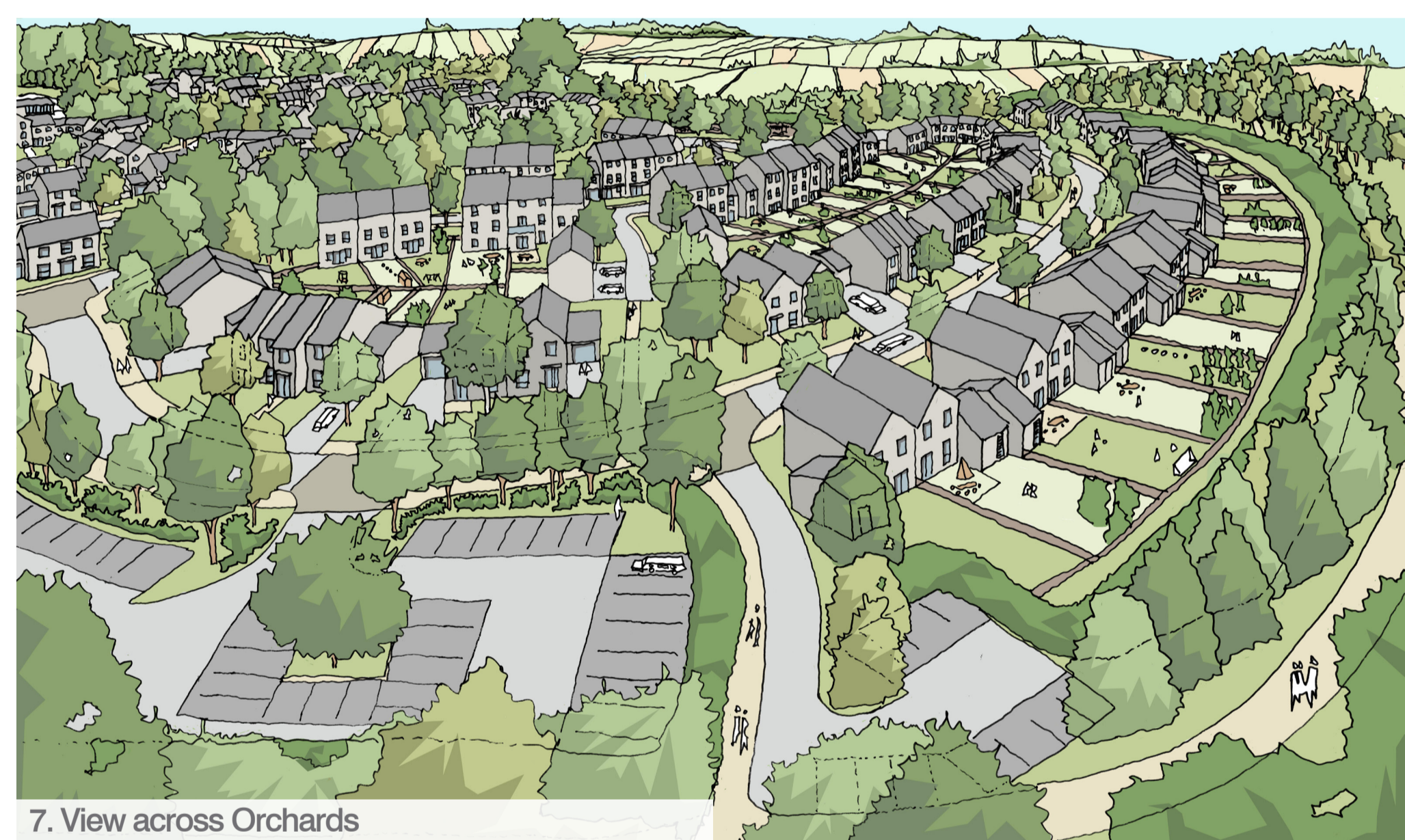
7. View across Orchards