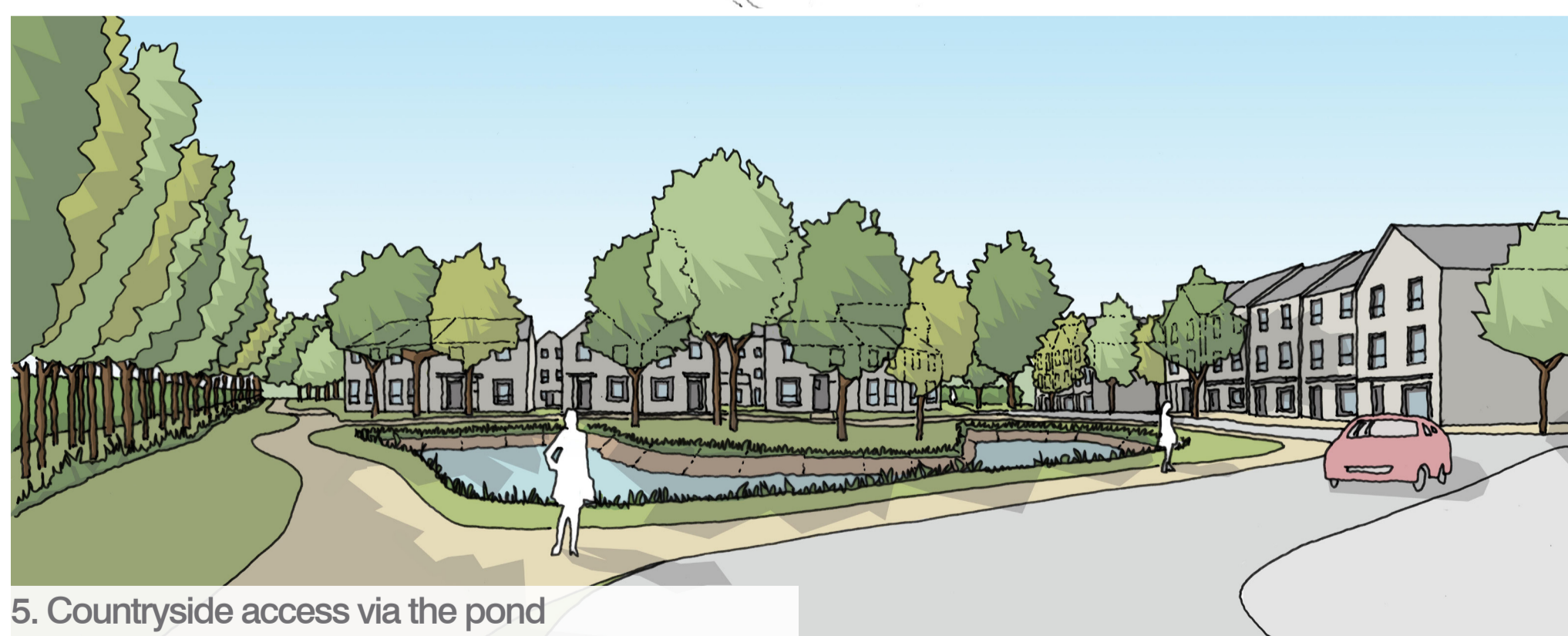
5. Countryside access via the pond