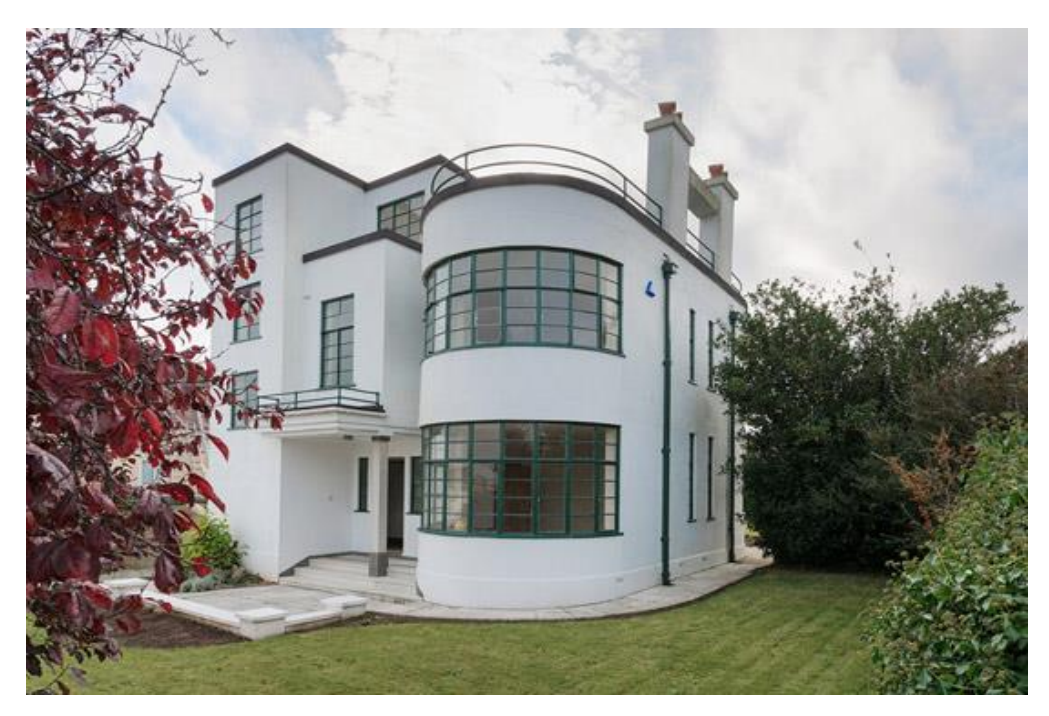
Figure 36: The Melville Aubin designed Sunpark, a 1930s art deco property in Park Avenue.

7.8.19 A number of buildings in Higher Brixham outside the conservation area are of historic significance. Gentry houses were built as villas in landscaped grounds with drives such as Laywell House in Summer Lane, Laywell Cottage (Aylmer), Kings Barton and also the very different 1930s modern movement house "Suncourt" in Park Avenue.