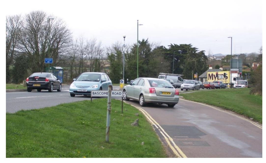
Figure 17: Windy Corner junction, a major cause of present day traffic congestion.

6.5.2 The new road has realigned the junction at the bottom of Hamelin Way so that access to the Western Corridor (A390), known as the Ring Road, is speedier after a short 10-minute journey from Newton Abbot. However, there are now 12 sets of traffic lights to Windy Corner, which restricts the flow of traffic along the western corridor, leading to severe congestion and greater CO<sub>2</sub> emissions.