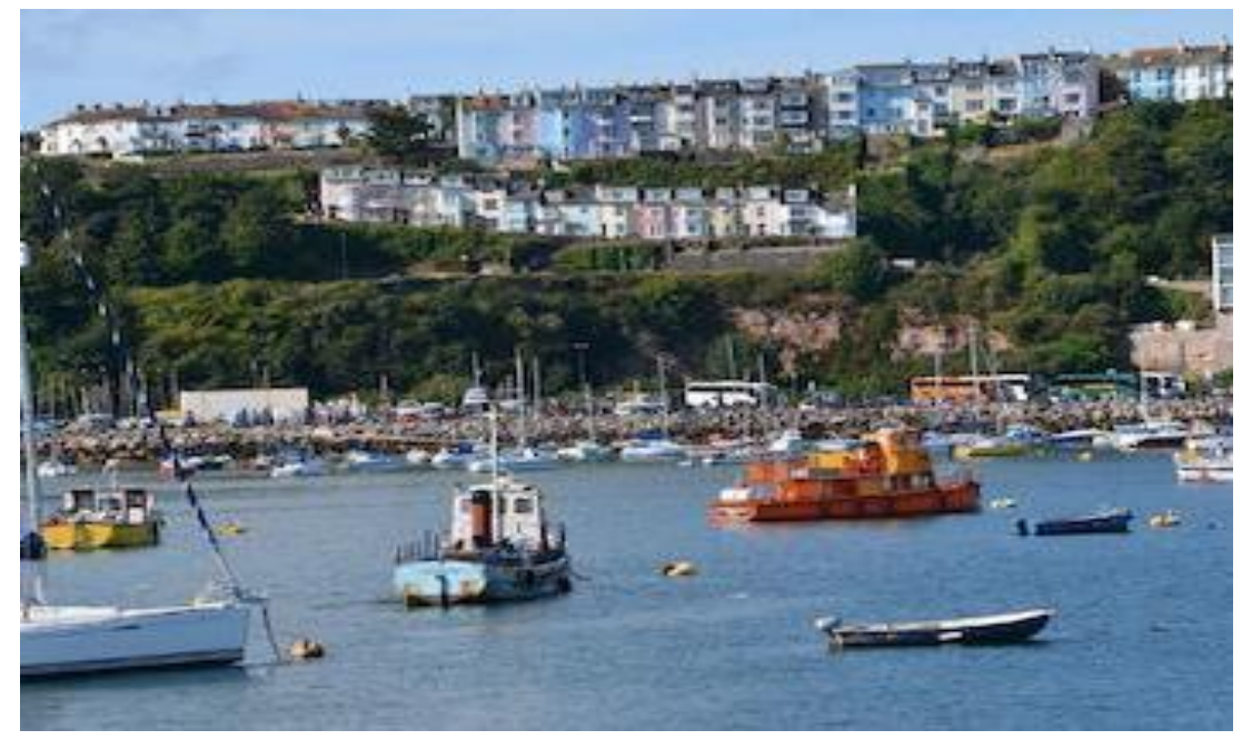
Figure 25: Furzeham terraces overlooking Oxen Cove and the outer harbour.

7.5.2 In this area there is little scope for large-scale development. The houses have been built on the steep hillsides overlooking the harbour and looking out to sea, with small narrow lanes and access by steps to many of the older tucked away terraced cottages. The cliff face supports green vegetation which coats much of this area between the terraces of housing.