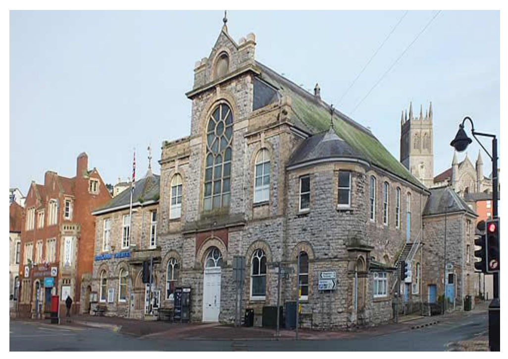
Figure 21: Brixham Town Hall and Scala Market Hall at Bolton Cross, with the tower of All Saints Church in the background.

7.4.2 New Road is the main arterial road into the town centre of Brixham. It carries the majority of vehicles that need to access the fish quay and the several industrial estates, and brings tourists into the town.