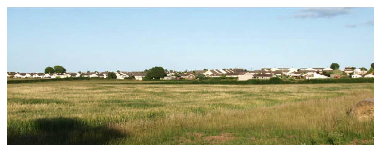
Figure 28: Looking towards the Brixham/Churston boundary where the properties on North Boundary Road are highly visible.

7.7.3 These bungalows are occupied by people who value the views out of the rear of their properties over the open green fields and adjoining countryside towards Churston.