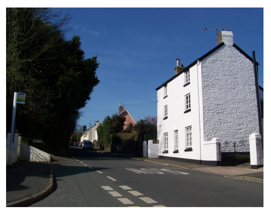
Figure 42: The early 19<sup>th</sup> century Challeycroft in Milton Street has an unusual plan form being a type of early semi-detached dwelling, with an extra storey and originally a single central common entry. It is now a single home.

7.8.27 There are no working farms in the conservation area today, but many are still in use as residences having been converted and their land developed.