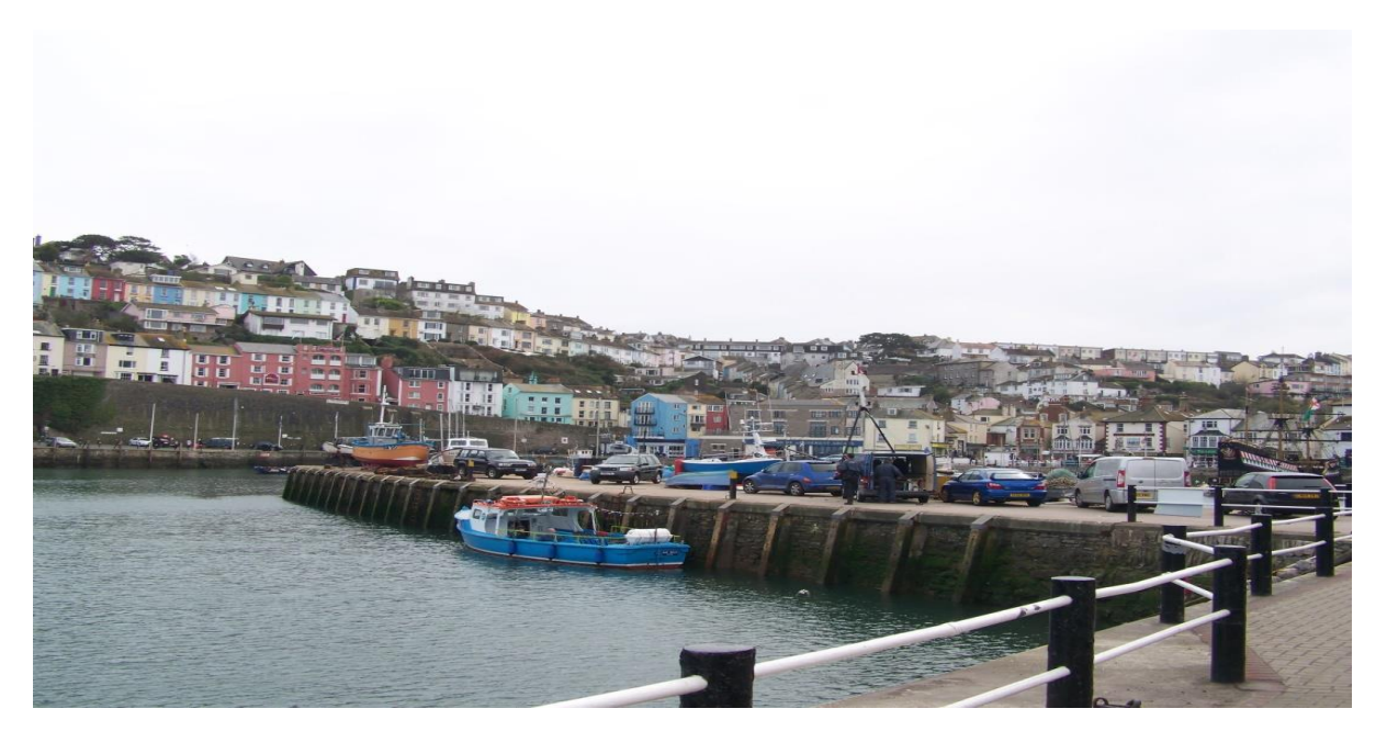
Figure 50: Brixham inner harbour showing the terraces of colourful cottages lining King Street on the left with the steep hillside behind and more terraces of cottages on the narrow roads linked by steep steps reaching up to the skyline.