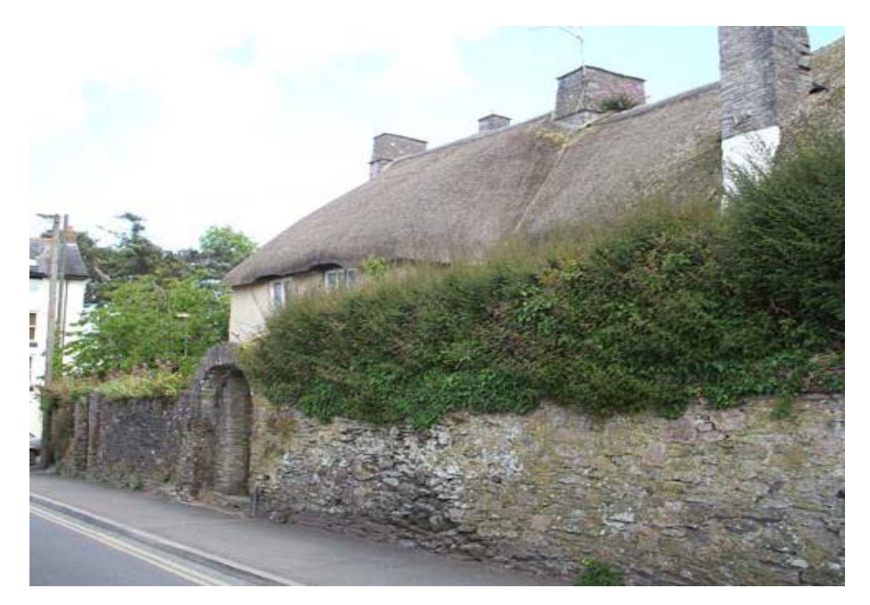
Figure 41: Hearthstone is a large through-passage early post-medieval thatched house now sub-divided. High hedges and trees above high walls enclose the lower house from public view. Wall, arch and chimney are all in local stone; the walls are in cob and stone.

7.8.26 There are only two thatched houses in Higher Brixham; they face each other on Milton Street at the bottom of Southdown Hill.