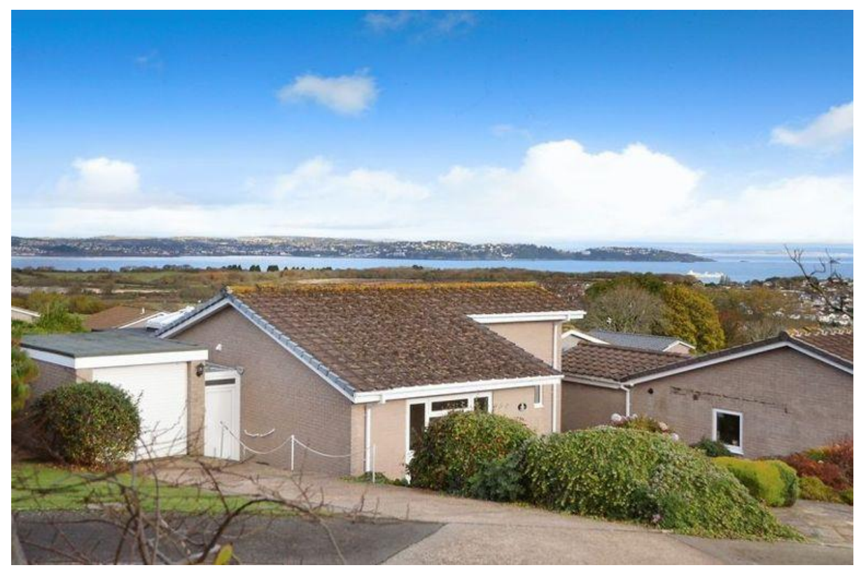
Figure 46: An example of bungalows at the upper end of Summercombe looking out over Torbay. The properties are mostly rendered with coloured tiled roof and an open frontage.