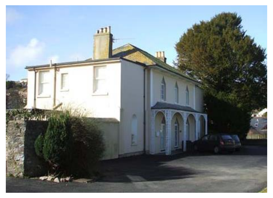
Figure 35: Aylmer, originally Laywell Cottage.

7.8.23 The revised 2<sup>nd</sup> edition County series map (published 1906) showed that there had been very little change in some parts of Higher Brixham over the previous 40 years. This was different to the northern and eastern parts of the conservation area nearer to Lower Brixham. In the late 19<sup>th</sup> century it became more urban in character because it had grown to accommodate its increasing population.