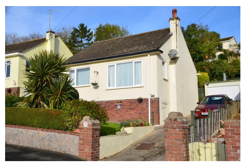
Figure 31: The bungalow style found in this area with red brick and render finish. The properties rise up steeply from the pavements as well as being on a steep hill.