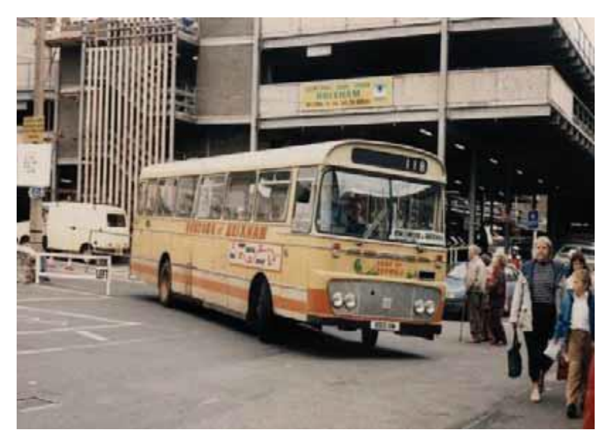
Figure 13: Old Multi-storey car park.

3.0.35 The gas works, nearby old cottages and buildings were demolished in the late 1960s to make way for a new multi-storey car park which was built in the centre of the town in 1969. Middle Street was also widened during this period and the fire station and Police station were moved out of the town centre.