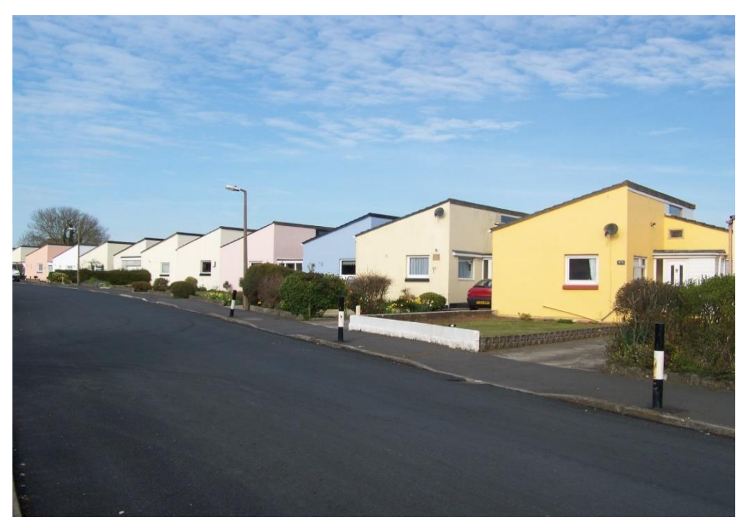
Figure 27: North Boundary Road (the rear of these bungalows marks the green Brixham/Churston boundary).

7.7.3 These bungalows are occupied by people who value the views out of the rear of their properties over the open green fields and adjoining countryside towards Churston.