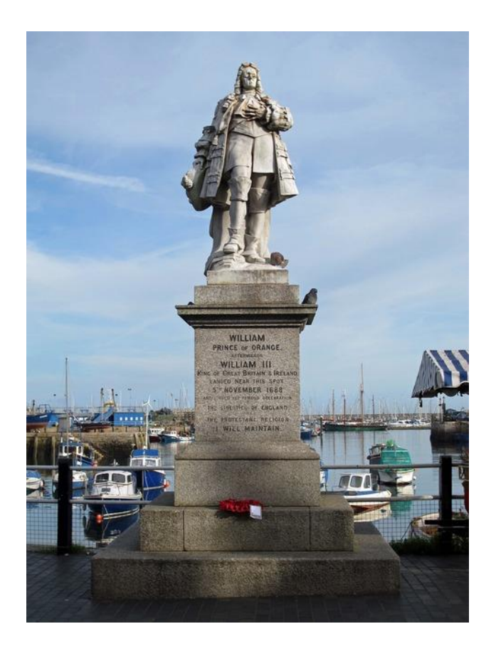
Figure 14: Prince of Orange Stature, The Strand Brixham.

Selected sources : Books and journals Gregory, C., Brixham in Devonia, (1896–63).