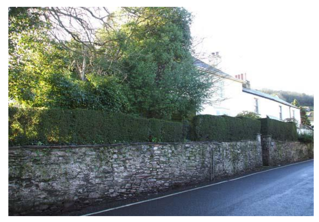
Figure 32: Upper Milton Street, showing the high Devonian limestone walls — rubble-built walls are typical of much of this part of Brixham where they act as boundaries and terraces; the mature hedges above add to the sense of enclosure.