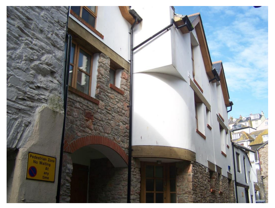
Figure 16: A sympathetic well-designed example of a Mews development in Pump Street off Fore Street.