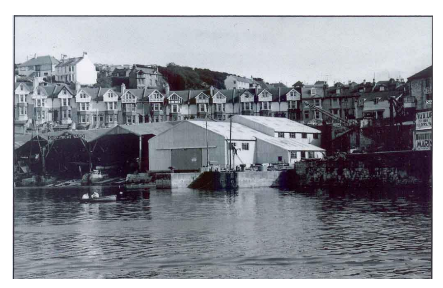
Figure 7: J. W. & A. Upham's Yard, 1960s with Berry Head Road in the background.

3.0.13 In 1817 Upham's Shipyard was built. Many of the local trawlers and sailing boats were built in the Yard in the 19<sup>th</sup> and 20<sup>th</sup> centuries. However, as Brixham moved towards new fishing practices and modern methods and diesel-driven vessels, traditional boat building waned and the shipyard closed in 1984.