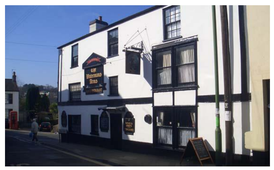
Figure 45: The Watermans Arms.

7.8.29 To the south, The Bell Inn has a formidable late 18<sup>th</sup> century Georgian frontage over three floors, with large tri-partite sash windows and an imposing pilastered door entry with an entablature over.