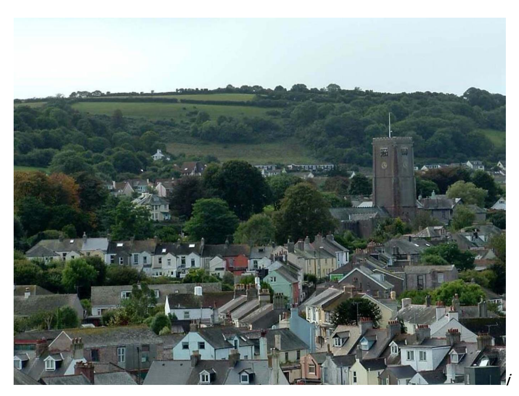
Figure 33: St Mary's Church, Higher Brixham.