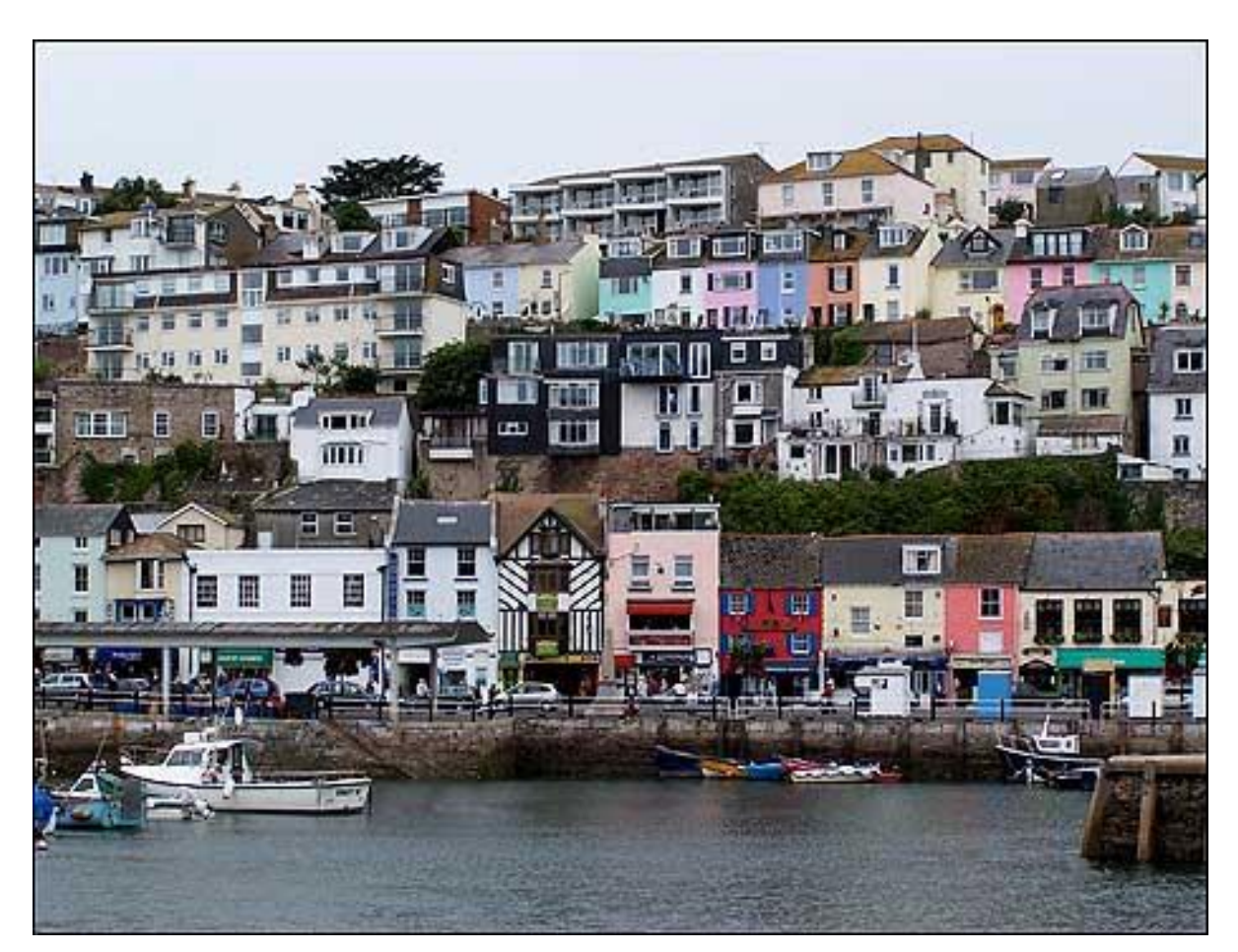
Figure 51: The quayside showing part of the old fish market to the left and the colourful densely packed terraces of cottages on the hillside.