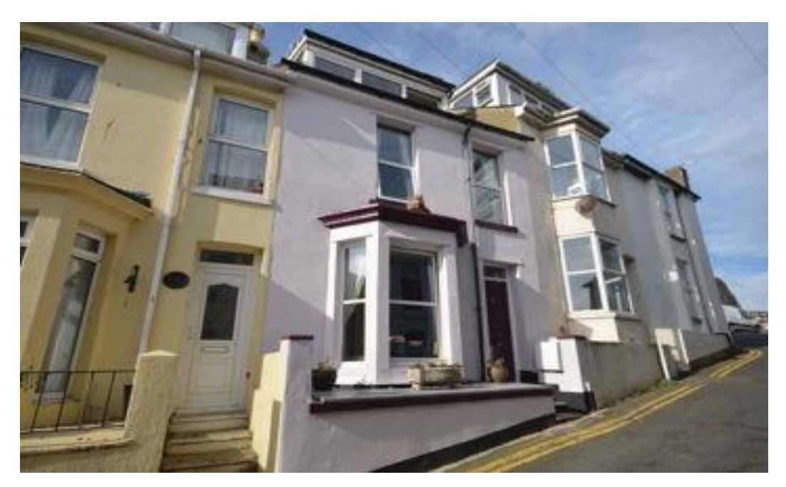
Figure 26: Typical style of terraced housing in North Furzeham Road showing roof-top dormer extensions.