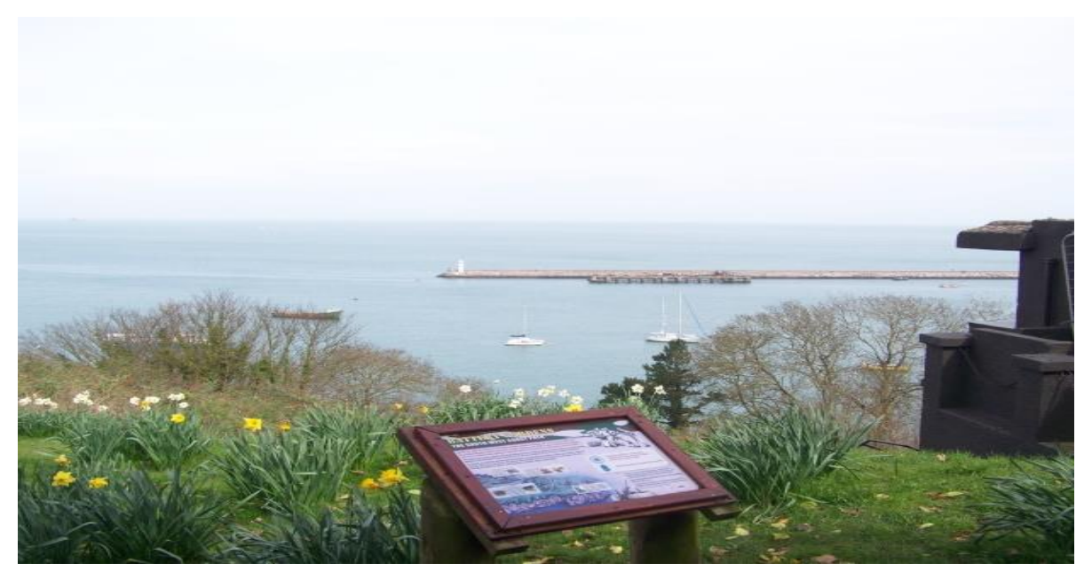
Figure 53: View towards Brixham Breakwater from Battery Gardens.

businesses. This is why it is hoped that new developments will include an adequate supply of affordable housing of the size and type that allows local first-time buyers to remain in their home town. The provision of affordable housing is detailed in the Policies Document. From the design guidance perspective, the "General Design Guidelines" apply equally high standards to affordable housing and to open market housing.