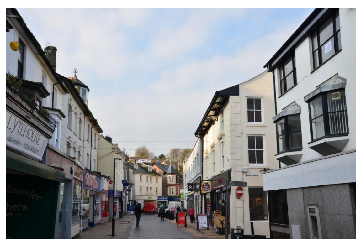
Figure 19: Fore Street has one-way traffic and is pedestrianised 10 am until 10 pm.