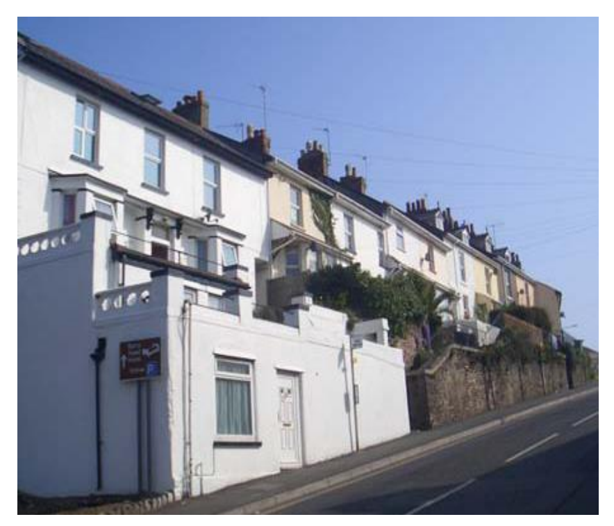
Figure 38: The terraces of Rea Barn Road.