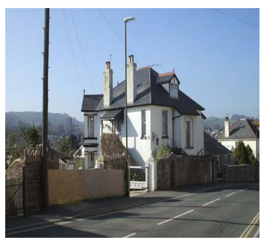
Figure 39: Cadgwith House, Rea Barn Road, one of the Edwardian detached houses in large grounds on the south side of the road and the best one, with projecting bays to the east and south to make the most of the aspect.