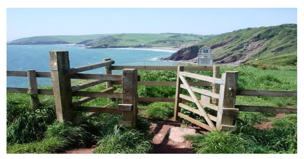
Figure 4: Sharkham looking towards Mansands.

2.7.3 Five particular sites of interest in Brixham are Berry Head to Sharkham Point, Breakwater Quarry, Brixham Cavern, Churston Cove and Point, and Shoalstone.