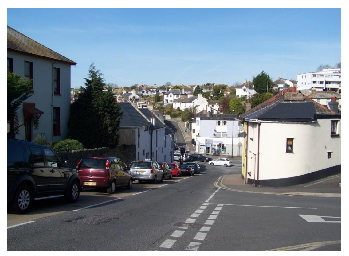
Figure 47: Rea Barn Road with Burton Square at the bottom of the hill.

storey Edwardian terrace before coming to the Police Station together with the Church of England Primary School, Brixham College, the Admiral Swimming Centre and the Rugby Club, which are all found quite close together. There is a mix of modern houses built on the site of the old paint testing fields to the left overlooking the Police Station. Older larger detached properties in large gardens line the opposite side of the hill before a long section with semi-detached and short terraced, mostly rendered, houses forks right into Gillard Road. The Penn Meadows housing estate occupies the sloping valley sides with Penn Meadows in the centre valley bottom leading down to the rear of the Cottage Hospital and the Ambulance Station, and side roads leading off to the rest of the estate.