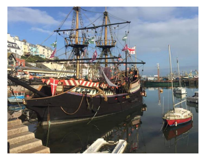
Figure 3: The Golden Hind replica, a favourite tourist attraction in the inner harbour.

2.6.1 Brixham's second most important employment sector is tourism, which has links with the fishing industry, the Marina sited in the outer harbour, the Heritage boat fleet with its fascinating maritime history, the Shoalstone seawater bathing pool, as well as other maritime attractions and activities.