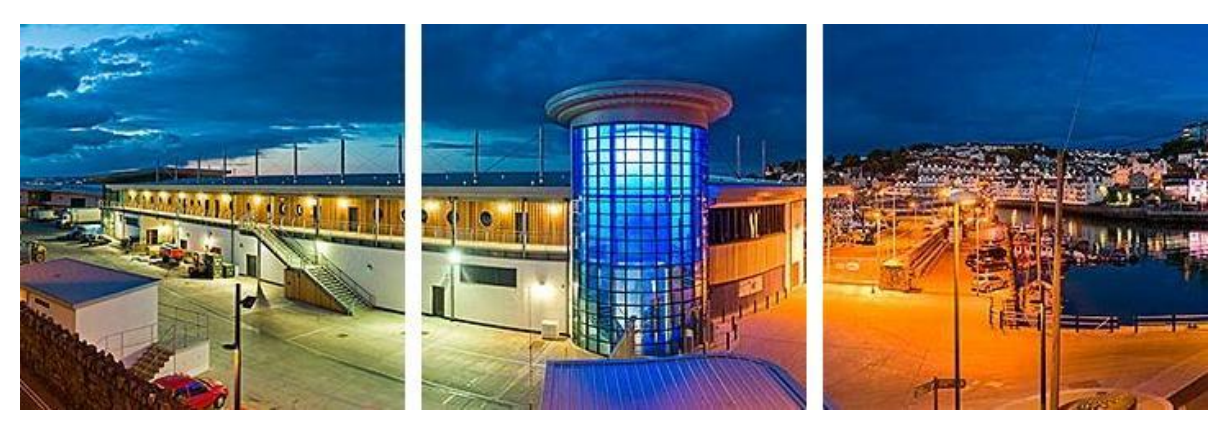
Figure 2: The new Brixham Fish Market.