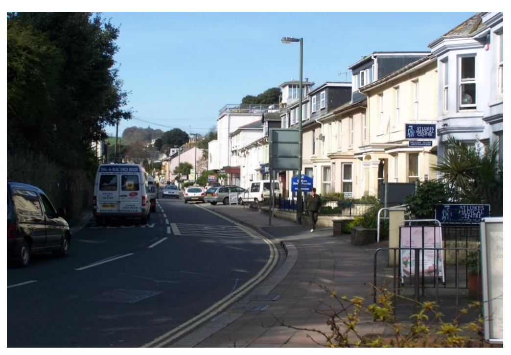
Figure 22: New Road leading out of Brixham.

7.4.2 New Road is the main arterial road into the town centre of Brixham. It carries the majority of vehicles that need to access the fish quay and the several industrial estates, and brings tourists into the town.