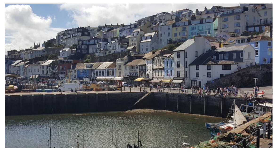
Figure 49: The Quay area of Brixham Harbour showing the tightly packed cottages and the variety of colourful buildings rising steeply up to the skyline in this conservation area. The tower of All Saints Church can be seen in the background on the skyline to the left.

7.12.5 The town receives a large number of tourists via the Brixham/Torquay Ferry link which plays a vital part in the economy of Brixham. Local residents also like to use the ferry to cross the Bay and this all has a significant impact on helping to reduce carbon emissions, car usage and parking demand in Brixham.