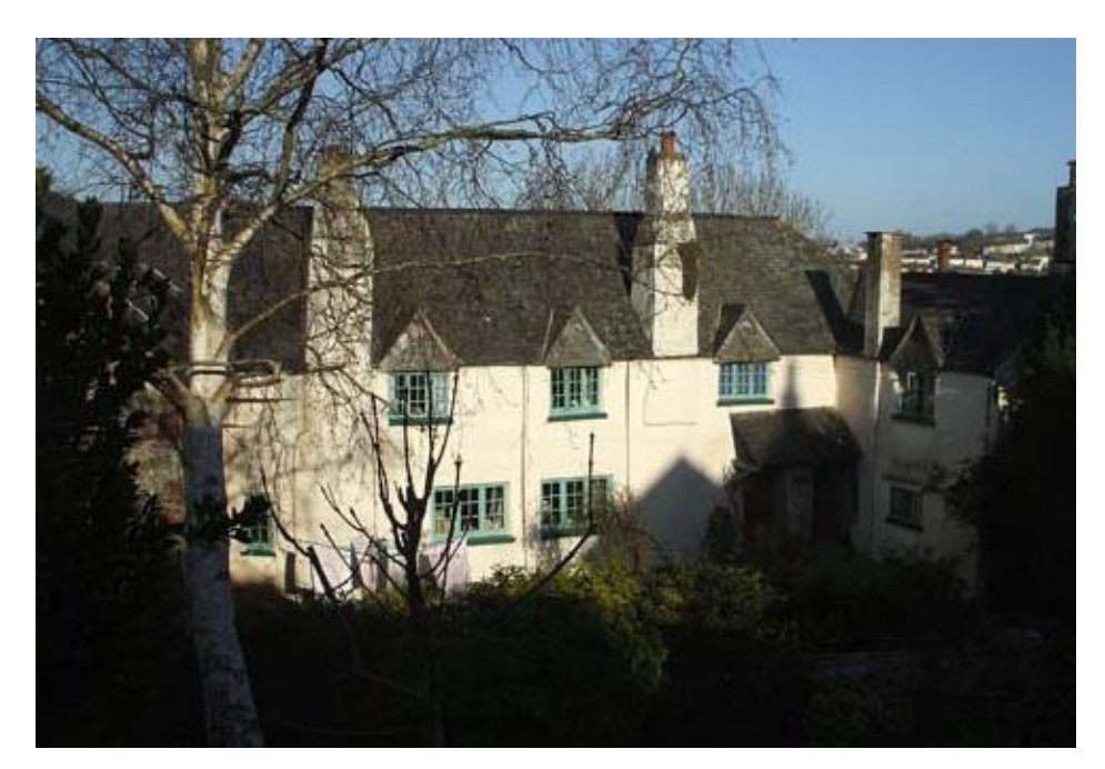
Figure 43: Greenover Farm, Horsepool Street (historically Hill Farm), which is rather grander than Higher Brixham's other 17<sup>th</sup> century farmhouses, although it has the same through passage plan, and later side wings. With trees in full leaf there is a fine sense of enclosure.

7.8.27 There are no working farms in the conservation area today, but many are still in use as residences having been converted and their land developed.