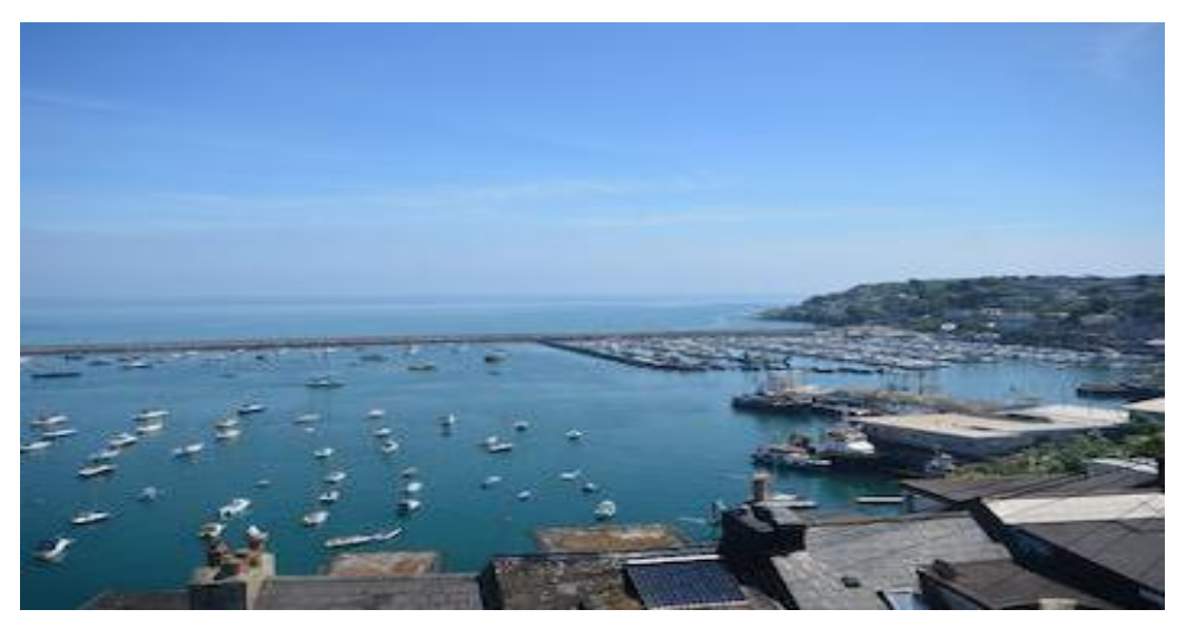
Figure 23: Roof top view from Furzeham over Brixham outer harbour with the Marina and Breakwater in the background.

7.5.1 This area extends north from the flat centre and harbour, and rises up the northern slopes to the plateau where the railway arrived in the 1860s, so is defined by early to mid 19<sup>th</sup> century development. All Saints, the new Church of the period, is the most prominent building. The narrow streets are linked by typical series of step-ways set with cream-coloured pavers. On the northeast side, three terraces on or close to North Furzeham Road look out to sea rather than inland. Furzeham Gardens and the early houses of Bella Vista Road lie outside the designated area but are important visual and architectural elements of the townscape here, and should be considered for formal inclusion within it.