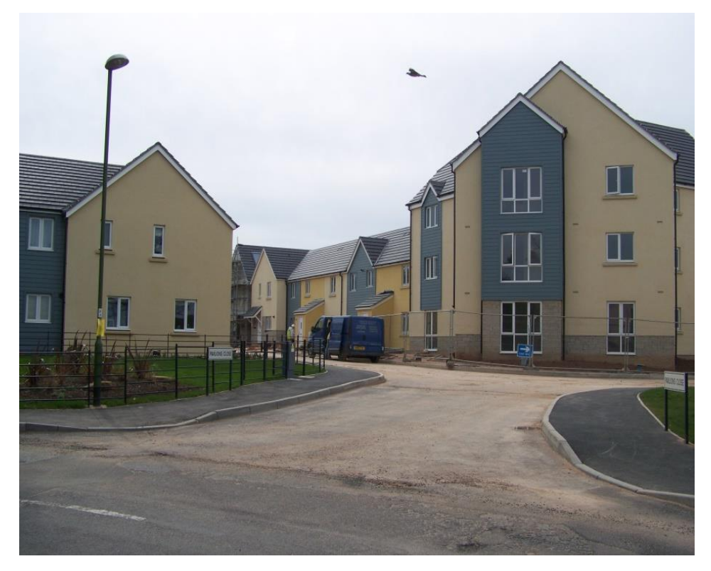
Figure 29: Cricket Club Housing Development 2010 on the site of the former Cricket ground.