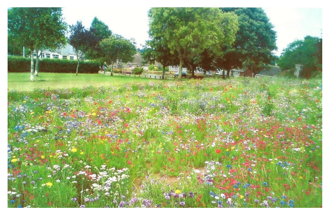
Figure 34: Wild flower meadow, St Mary's park.

7.8.19 A number of buildings in Higher Brixham outside the conservation area are of historic significance. Gentry houses were built as villas in landscaped grounds with drives such as Laywell House in Summer Lane, Laywell Cottage (Aylmer), Kings Barton and also the very different 1930s modern movement house "Suncourt" in Park Avenue.