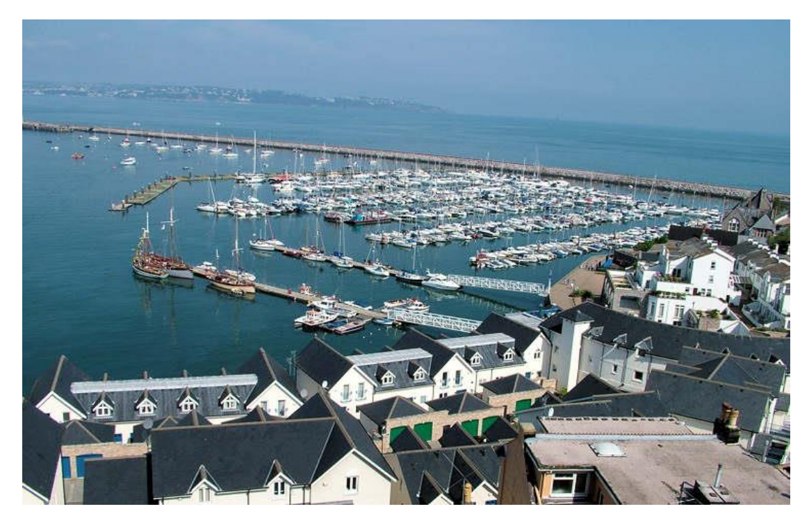
Figure 9: Brixham Marina with Moorings Reach development and the heritage pontoon in the foreground and Brixham Breakwater in the background.

3.0.15 By 1850 Brixham's fleet was established as the largest Fishery in England with 270 vessels, employing 1,600 seamen. Known as the "Mother of Deep-Sea Fisheries", its boats helped to establish the fishing industries of Hull, Grimsby and Lowestoft. The fishing industry provided local employment for boat builders, sail makers, rope makers and other crafts connected with the marine industry which helped the town to grow.