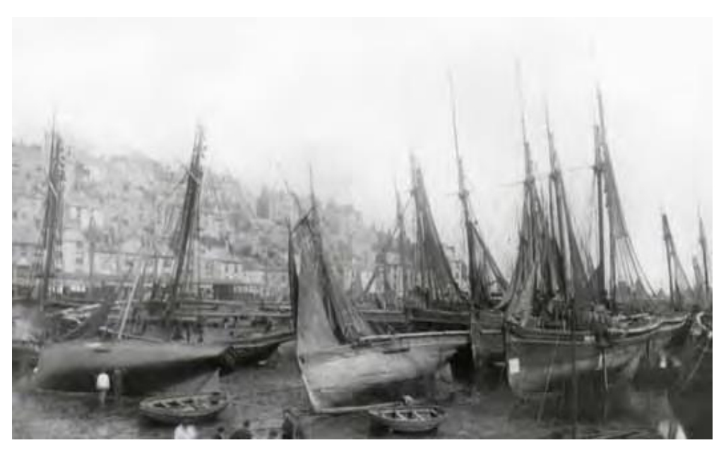
Figure 10: Brixham Harbour 1868.

3.0.15 By 1850 Brixham's fleet was established as the largest Fishery in England with 270 vessels, employing 1,600 seamen. Known as the "Mother of Deep-Sea Fisheries", its boats helped to establish the fishing industries of Hull, Grimsby and Lowestoft. The fishing industry provided local employment for boat builders, sail makers, rope makers and other crafts connected with the marine industry which helped the town to grow.