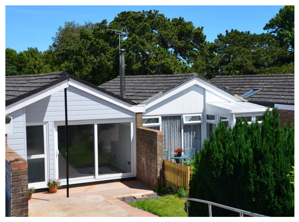
Figure 30: The Cumber Bungalows are very similar in design with large window frontages and the build density is high.