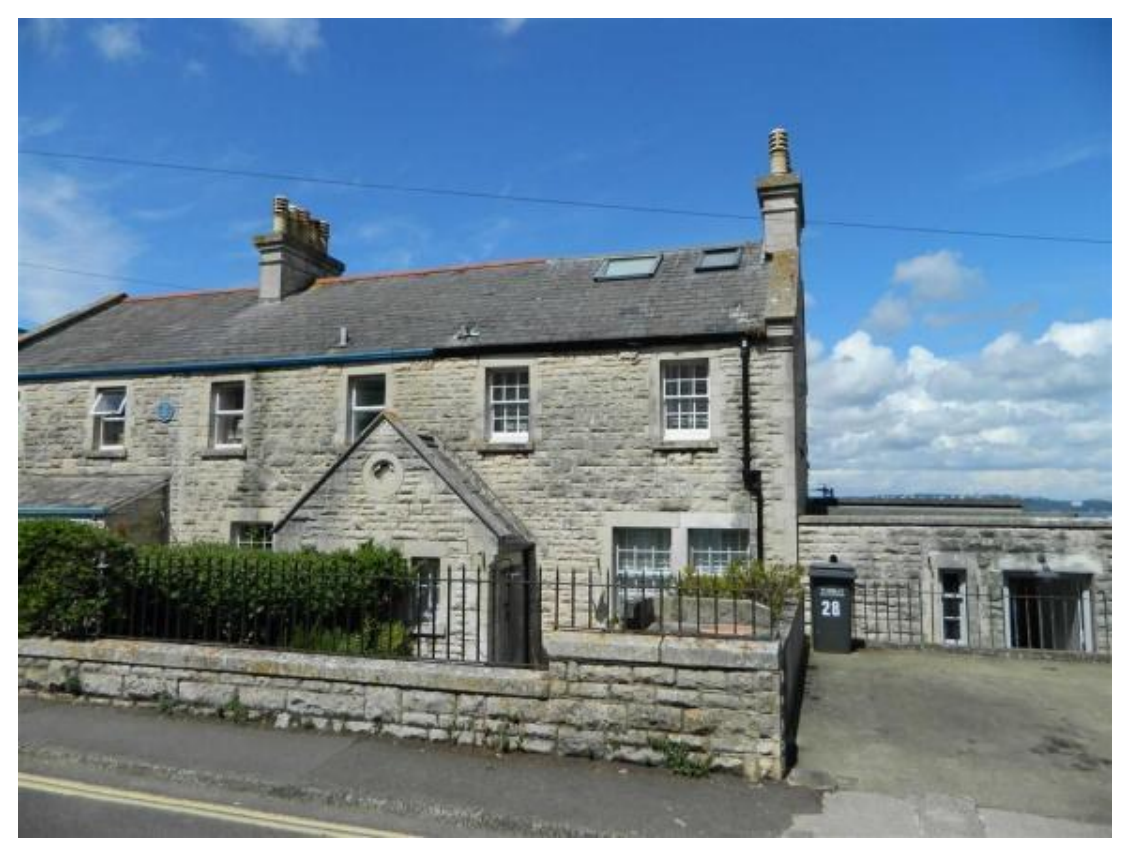
Figure 20: The coastguard cottages on the seaward side of Berry Head Road.

junction along Berry Head Road to include the breakwater, D-Day embarkation ramps, Shoalstone Pool and the Coastguard Cottages. The prehistoric scheduled monument of Ash Hole Cavern lies on, but outside, the designated boundary. The eccentric Edwardian Villa of Wolborough House and a few others lie above the coast road.