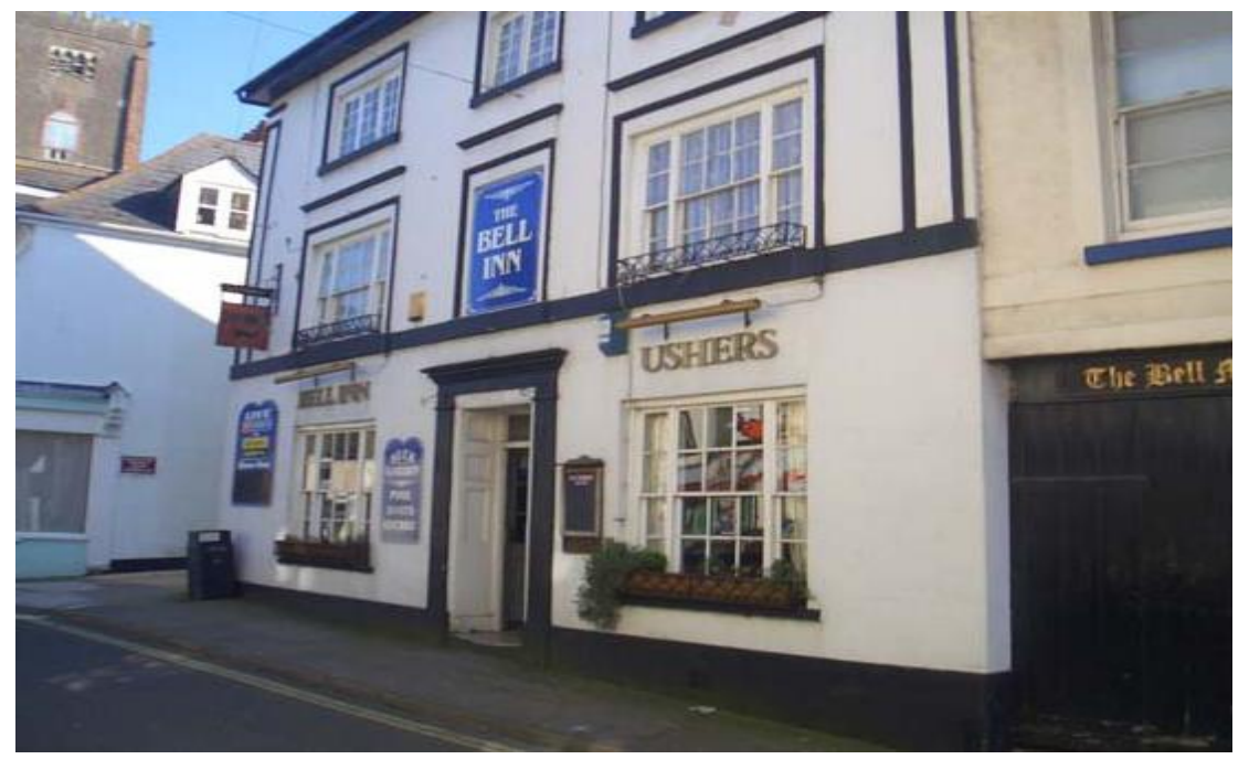
Figure 44: The Bell Inn.

7.8.28 Two long-established public houses west of the church "square" in Drew Street almost face each other.