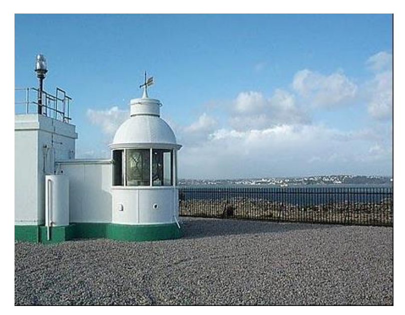
Figure 12: Berry Head Lighthouse – c. 200 ft above sea level.

3.0.27 Semaphore signalling apparatus was used on Berry Head before 1875 and acted as the Lloyds' Signal Station for Tor Bay. In 1906 the Berry Head Lighthouse, an active lighthouse, was built; it was automated and converted to run on acetylene in 1921 . There is also a VOR/DME beacon used for air traffic control in one of the woodland areas on the headland.