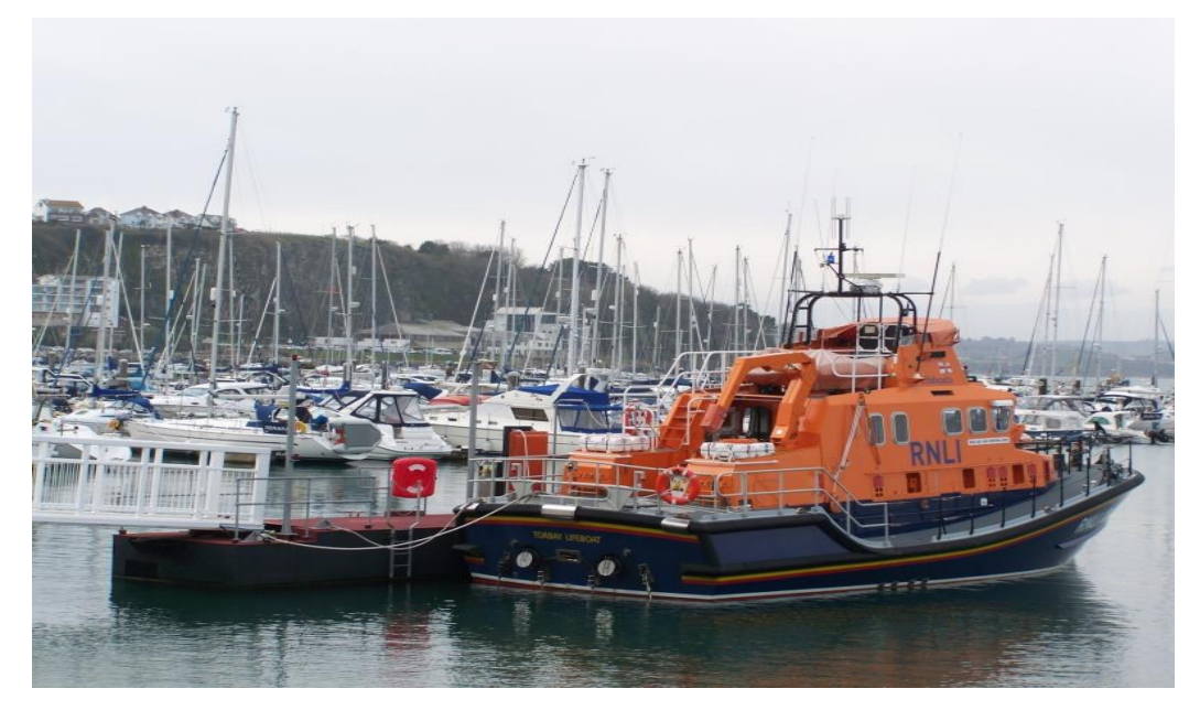
Figure 52: Torbay Lifeboat "The Alec and Christina Dykes" based in Brixham Harbour.