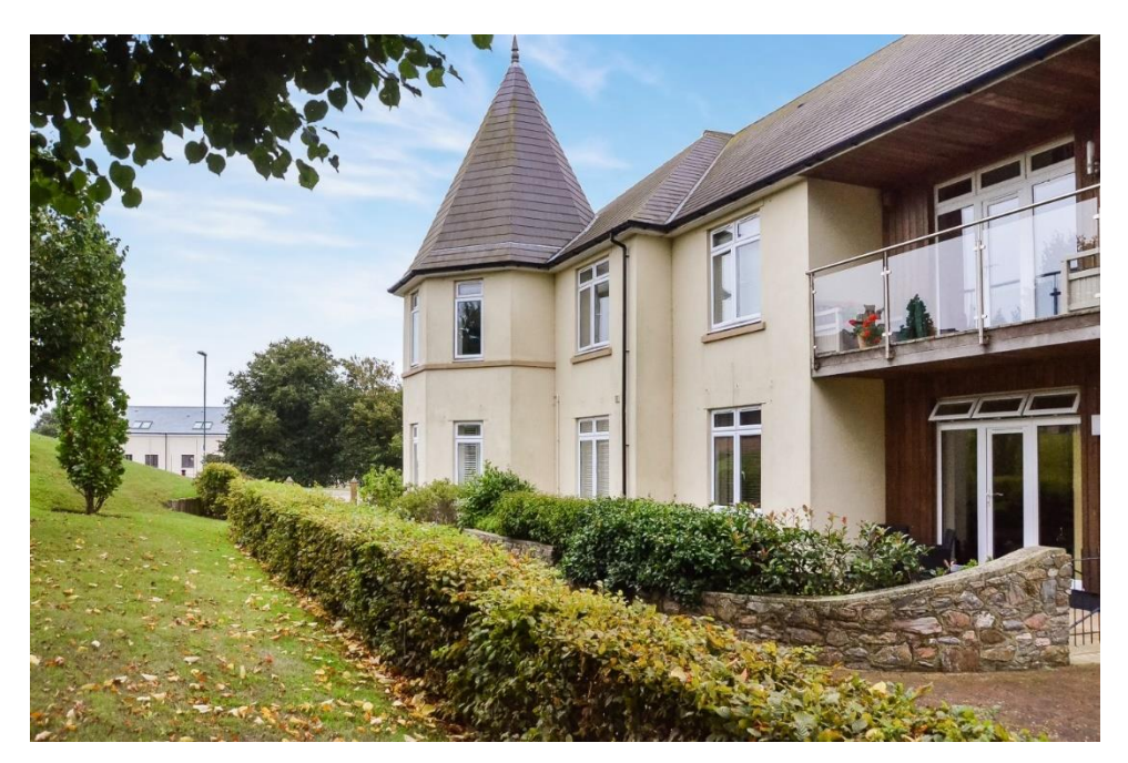
Figure 48: Development at Sharkham Village.

7.11.1 Sharkham Village is a more recent development, built on the hilly site of a former holiday camp. The houses are modern, with many different designs and sizes set out in terraces, with garage space underneath some of them. There is a green communal area in the centre of the development with playground equipment. The landscaping is good with mature trees preserved, and maintained gardens with shrubs, sculptures and green spaces. The final stage of the development is under way and the three-storey terraces have garage space underneath. There is a large green sloping meadow at the rear of this latest stage, with public footpaths leading down to St Marys Bay and the coastal footpath from Kingswear leading to Berry Head. The seaward coastal views are very special.