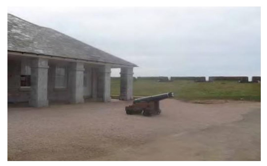
Figure 5: Guardhouse café and visitor centre in Berry Head Fort.

3.0.11 Today on Berry Head the Guardhouse café is located in the guardhouse in Berry Head's Northern Fort and the attached visitor centre has details of the history of Berry Head, its wildlife and its importance today.