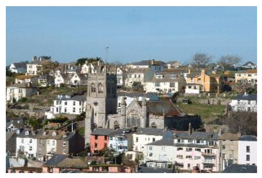
Figure 6: All Saints Church Brixham showing the variety of houses surrounding it.

3.0.12 In 1816 the new District Church of Lower Brixham was finished. It was built as a Chapel of Ease to address the increasing attendances at St Mary's Church due to rising population numbers in Lower Brixham. Reverend Henry Francis Lyte became the Church of England Minister Incumbent in the Lower Brixham Church from 1824 until he died in 1847 in Nice. He is well known for composing "Abide with Me". The hymn became soccer's first anthem and since 1927 has been sung before every FA Cup final.