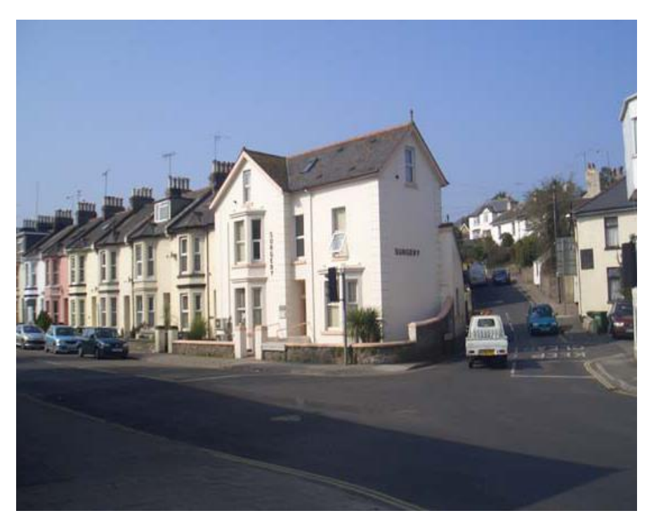
Figure 40: The Greenswood Road terraces with No. 1, the prominent three-storey building, on the corner with Burton Street at the Great Gate junction. It is an important landmark for both the Higher Brixham and Brixham Town conservation areas as this is where the historic settlement boundaries met. Today it is a doctors' surgery.

7.8.26 There are only two thatched houses in Higher Brixham; they face each other on Milton Street at the bottom of Southdown Hill.