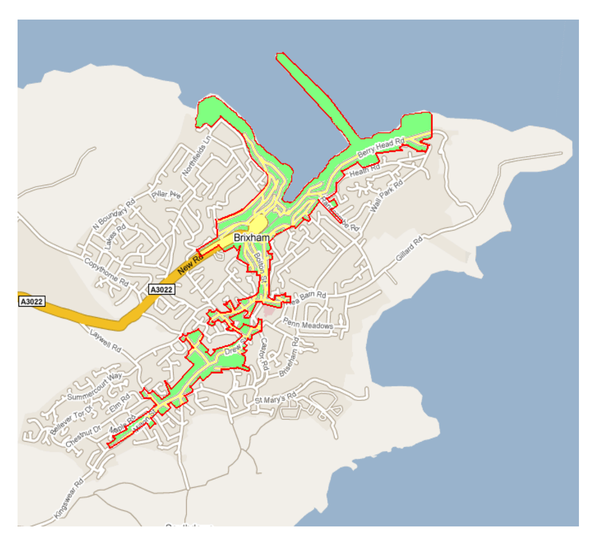
Figure 15: Conservation areas of the town were first designated in March 1976 and cover the harbour area and town centre and from Bolton Cross up through Higher Brixham and Milton Street towards Kingswear.

materials. Many of these changes are minor taken in isolation, but when added together they amount to serious damage to the historic integrity of a conservation area.