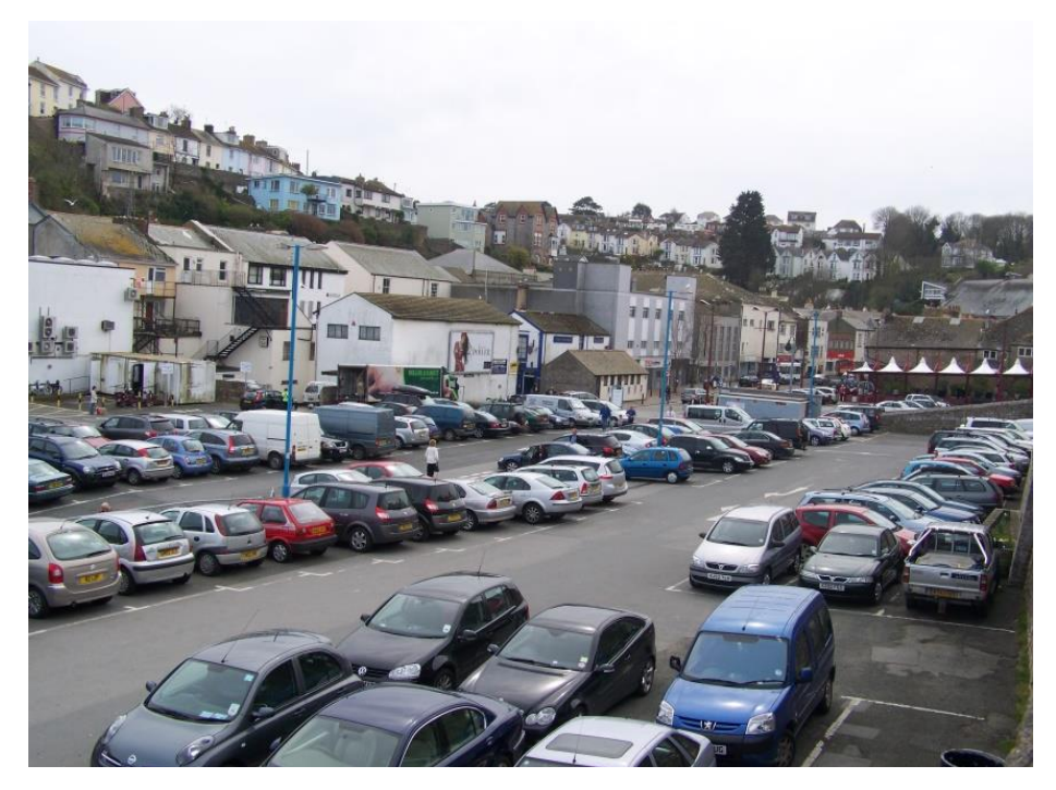
Figure 18: Brixham central car parking area, with the bus terminus in the background on the right, marked out by the up-turned white funnels. The buildings to the left border Fore Street which has a steep green cliff background before more terraces reach up to the skyline.