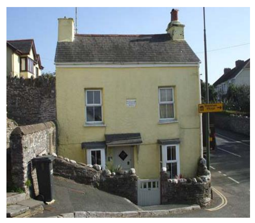
Figure 37: Roseacre Cottage dated 1836 half-terraced into the hill.