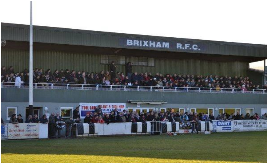
E4 – 2: Astley Park, home to Brixham Rugby Football Club.

E4 – 3: Battery Gardens. A site of great historical importance as well as aesthetic, natural and ecological value, home to the Brixham Battery Heritage Centre and coastal defences built in 1940. The whole area also commands stunning views across Torbay and to the west to Churston Cove to which it connects via the South West Coast Path.