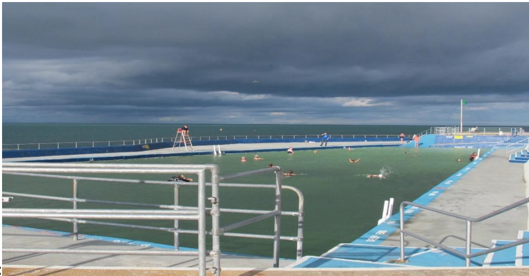
E4 – 9: Shoalstone Pool.

E4 – 9: Shoalstone. This area surrounds a stunning “Art Deco” icon of the South Devon coastline, Shoalstone Pool. This has been a much used recreational amenity for locals and visitors alike since its construction in 1926. Throughout its history, its survival has been entirely dependent on practical and financial support from generations of local communities, none more than today where its very existence owes itself to massive community support.