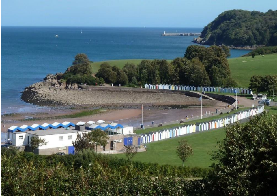
E4-14: Broadsands beach with the Elberry grassy headland behind the row of trees, which leads to Elberry Cove and beach.

E4 – 15: Warborough Common. This area of unmanaged rich calcareous grassland has been Common Land since 1604. It is prized by locals and visitors for its recreational, historical and ecological value, it functions as the gateway to Galampton. It boasts natural beauty and outstanding views.