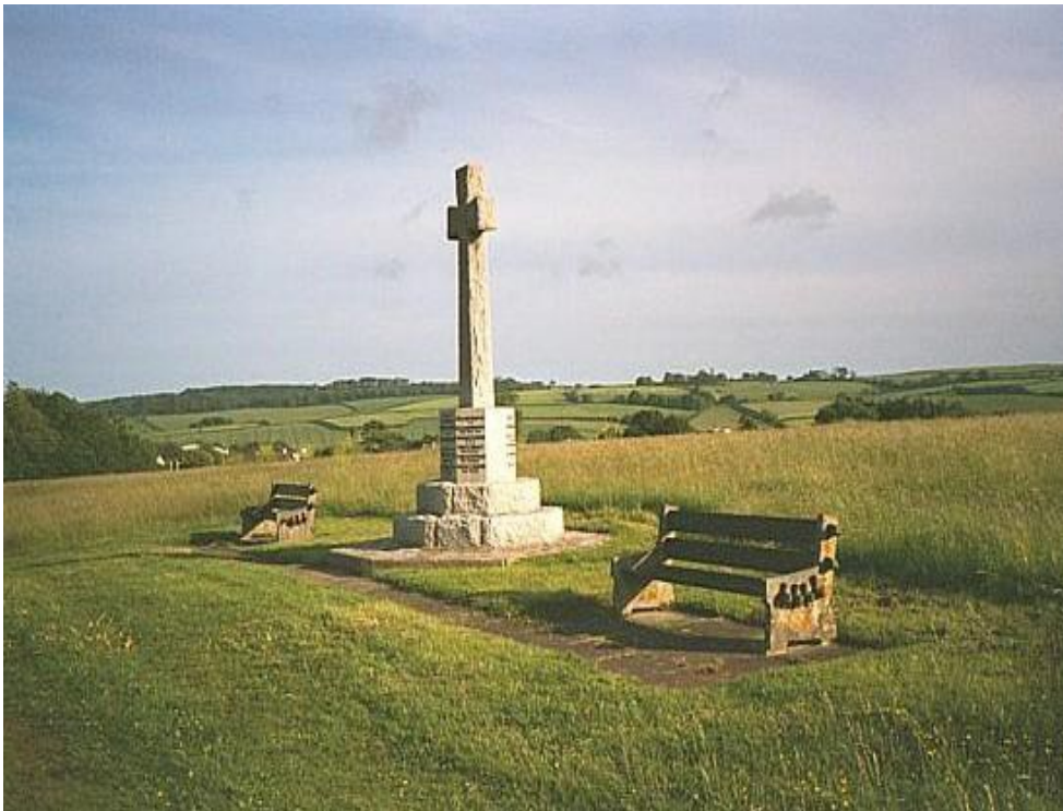
E4 – 15: Galampton Warborough Common and the War Memorial.

E4 – 15: Warborough Common. This area of unmanaged rich calcareous grassland has been Common Land since 1604. It is prized by locals and visitors for its recreational, historical and ecological value, it functions as the gateway to Galampton. It boasts natural beauty and outstanding views.