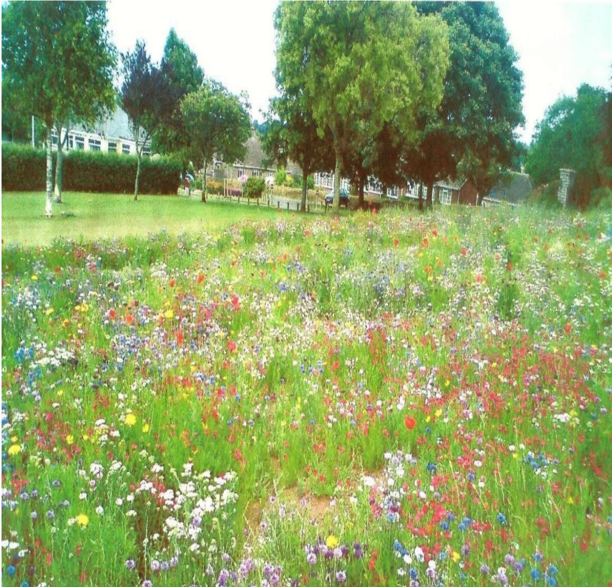
E4 – 11: St. Mary's Park Wild Flower Meadow.

E4 – 11: St Mary's Park. Adjoining the Higher Brixham Conservation Area, commanding panoramic views across the town towards the sea, this much-used park is the most important recreational area in Higher Brixham. Comprising sports field, bowling club, tennis courts and outdoor exercise equipment, it is used by members of the community of all ages. It also hosts the annual Hap'nin music festival, a well-established community organised event that could not be sited elsewhere.