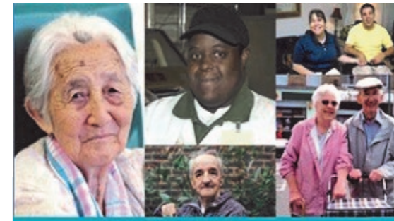
Mental Capacity Act 2005