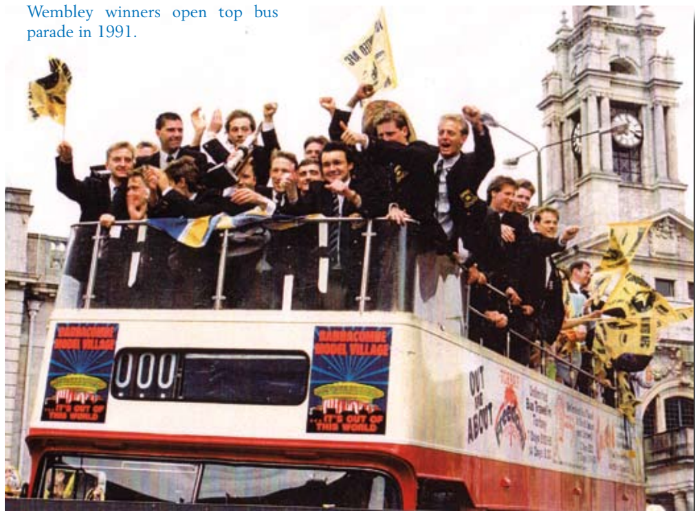
Wembley winners open top bus parade in 1991.