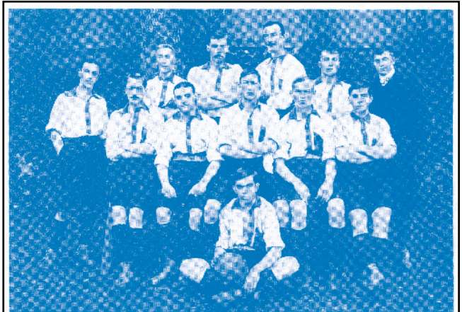
The first Torquay United Team to take part in League Football East Devon League 1901-02

On May Day 1899, a group of former pupils from Torquay Public College met at the Tor Abbey Hotel in Belgrave Road and formed Torquay United Association Football Club. In 1910, they merged with Ellacombe FC then, renamed Torquay Town, made their permanent home at Plainmoor. In their first season the team succeeded in becoming the first South Devon club to win the Devon Senior Cup. When Plymouth Argyle and Exeter City were admitted to the newly formed Third Division of the Football League in 1921, Torquay Town decided to follow their example. Joining forces with local rivals Babbacombe FC, they turned professional and once more became Torquay 'United'. Immediately after winning the championship of the Southern League (Western Section), the club achieved their ambition and were elected to the Football League in 1927. Unable to attract the huge attendances of the big money clubs, United struggled for survival in the lower divisions for eighty years before eventually losing their league status in 2007.