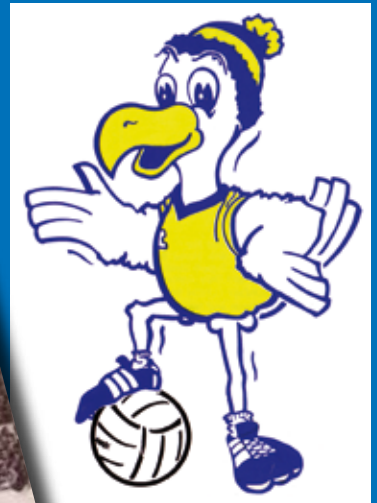
Gulliver Gull renamed Gilbert and a souvenir from 1968