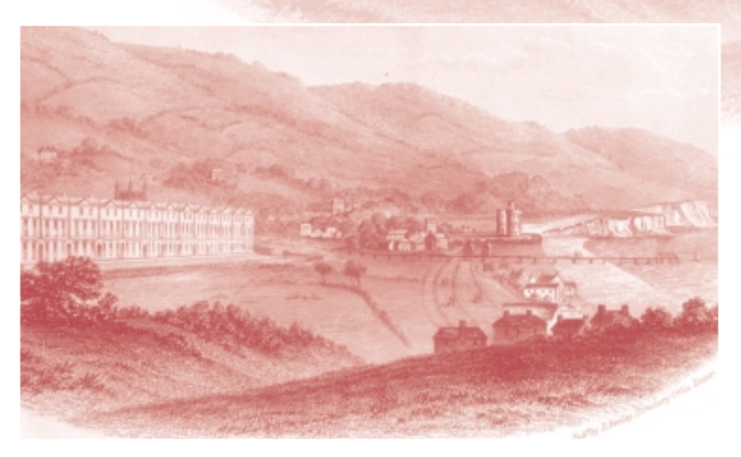
Paignton about 1880