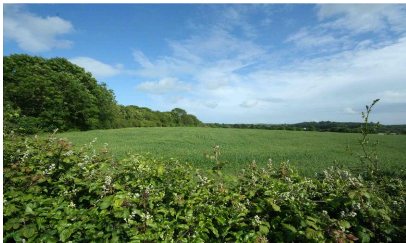
Figure 10: The large field at Brokenbury as viewed from Bridge Road.

5.1.2 Further down the road is Brokenbury field. This Large field is a critical natural green space which defines the change of character between the suburban continuum of Torquay round to Paignton and the entry onto the spectacular Brixham peninsular, with the attractive surroundings of Churston Ferrers at its gateway.