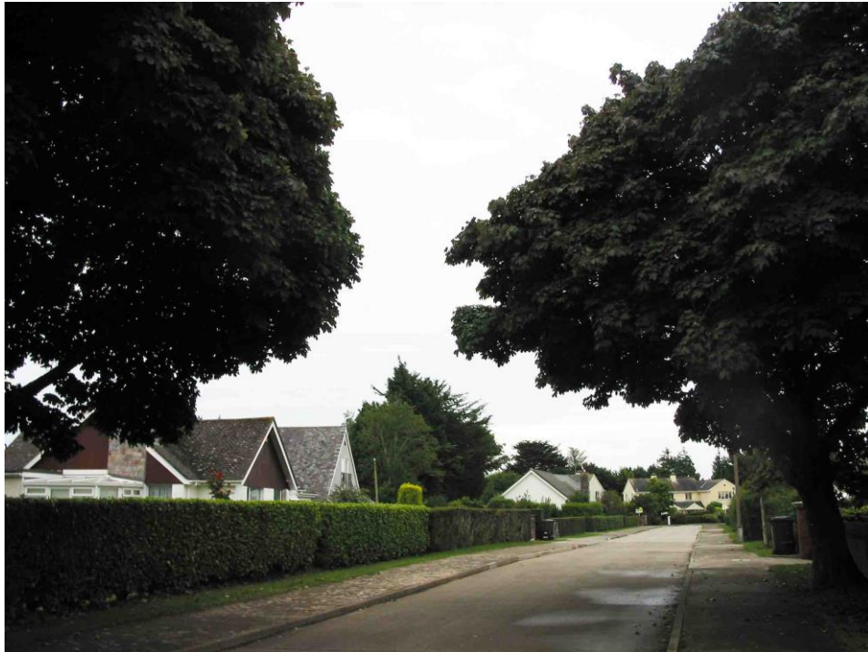
Figure 7: Warborough Road.

3.3.5 In keeping with the distinctive character of this area, future development should: