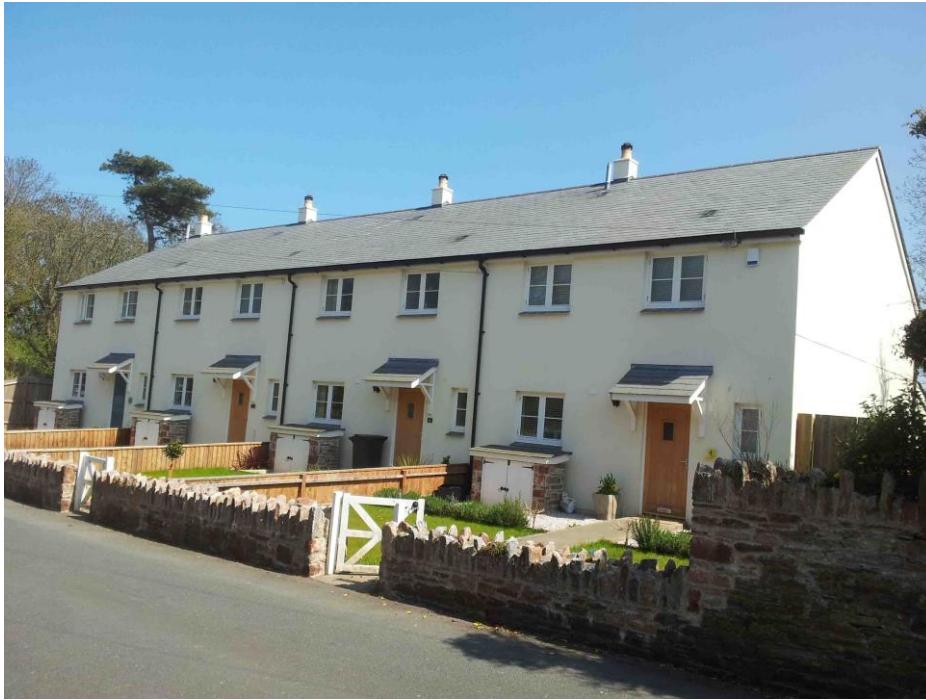
Figure 6: New build housing displaying good design principles.

3.1.8 In 1970, the Churston Conservation Zone was established as the first conservation zone in Torbay, with the specific aim of protecting this area. Even now the conservation zone is one of only two in Torbay where an “Article 4 Direction” has been made to remove Householder Permitted Development Rights; such is the perceived value and special character of this area by the Local Planning Authority.