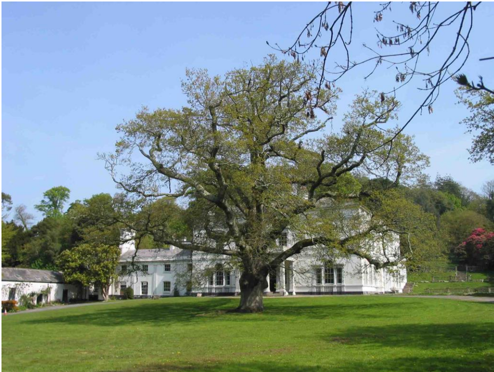
Figure 4: Lupton House.