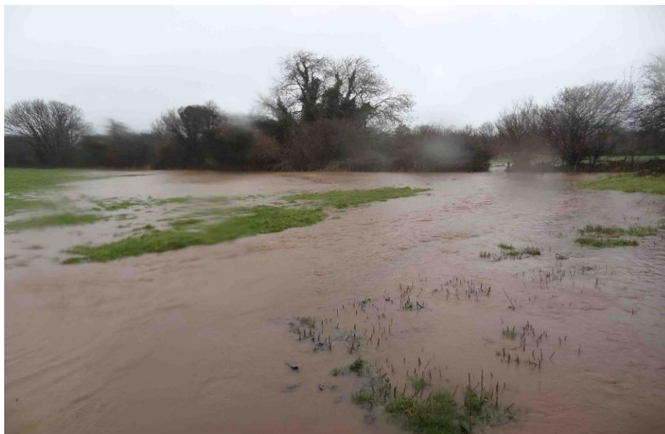
Figure 13: Flooded field.

5.5.4 In keeping with the distinctive character of this area future development should: