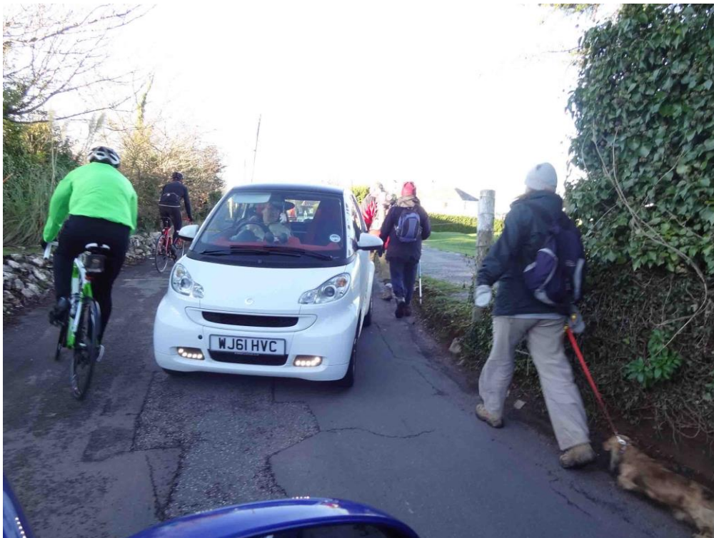
Figure 14: Bascombe Road at one of its narrower points.

6.2.3 This historical trading route runs parallel to the A3022 joining it on the Brixham side of Windy Corner. It is a popular route for cyclists, walkers and horse riders providing the only alternative to the main road. It has no pavements and for much of its length is little more than an unlit country lane with passing places. It also contains blind corners and poorly sighted junctions. In busy times it is used as a rat run to avoid the gridlock on the main road. This is despite it being unsuited to vehicles and the hazard caused to walkers and cyclists.