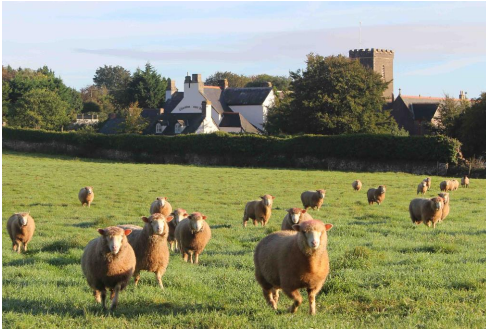
Figure 12: Sheep grazing with a backdrop of Churston Court and St Mary's Church.