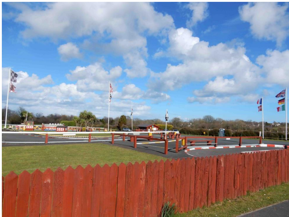
Figure 11: The Go-kart track.