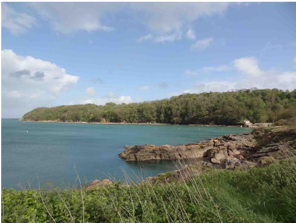
Figure 1: The undeveloped coastline of Churston as seen from Elberry Cove.

2.1.2 From Broadsands for 3 miles there is then a section of unspoilt undeveloped coastline stretching as far as the Port of Brixham to the south east. This undeveloped coast lies entirely within Churston.