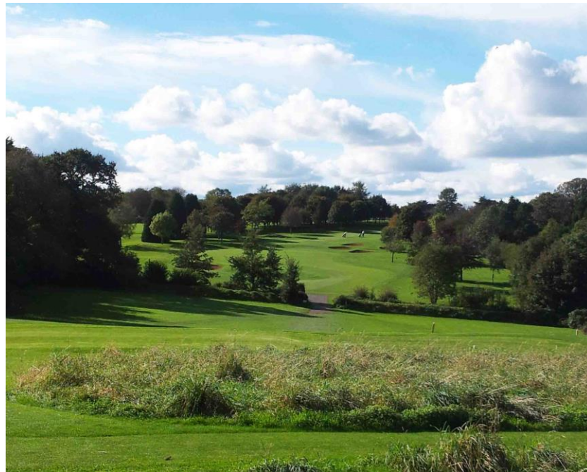
Figure 8: View of 3rd and 16th fairways from popular public footpath.

4.2.3 The openness of the course and the way the course connects to the wider surroundings of Churston makes a very significant contribution to the open and semi-rural character of the area, maintaining separation between patches of built development and a tangible connection with the open countryside. This link is as strong now as it was when Agatha Christie wrote about the area in the 1930s.