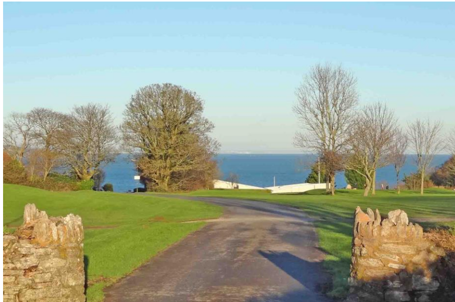
Figure 9: Iconic public view out to the Bay across the golf course from Bridge Road.