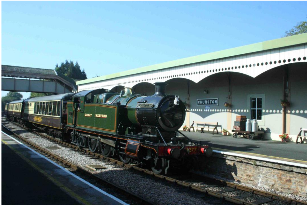
Figure 5: Churston Station.