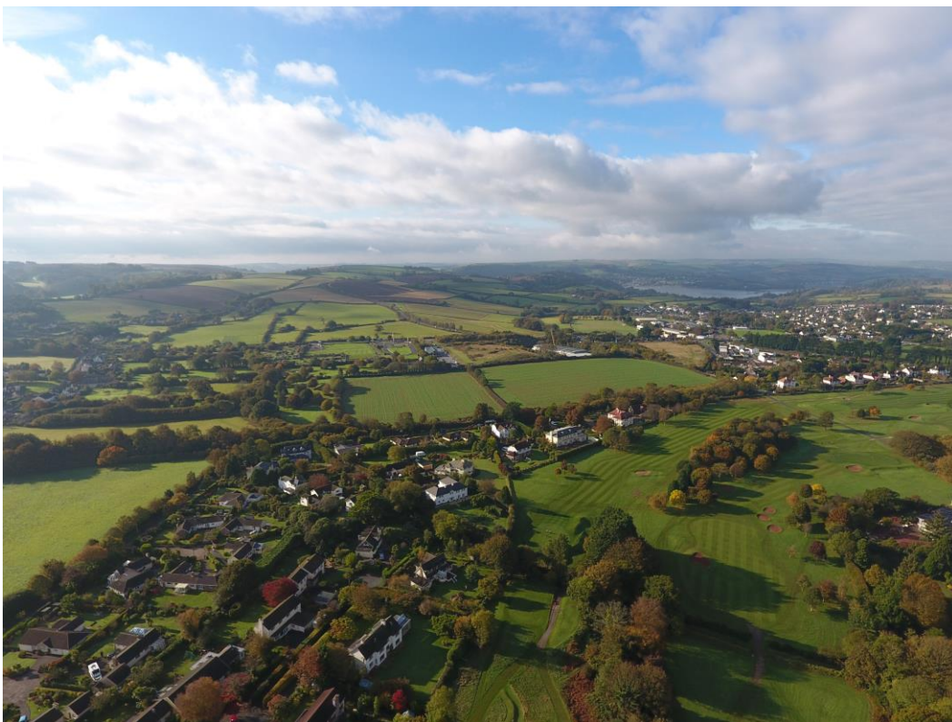
Figure 2: View towards the River Dart in the distance across the semi-rural environment of Churston.