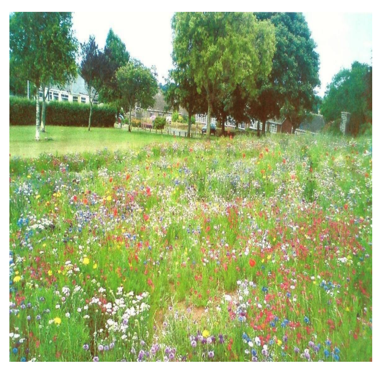
E4 – 11: St. Mary's Park Wild Flower Meadow.

E4 – 11: St Mary's Park. Adjoining the Higher Brixham Conservation Area, commanding panoramic views across the town towards the sea, this much-used park is the most important recreational area in Higher Brixham. Comprising sports field, bowling club, tennis courts and outdoor exercise equipment, it is used by members of the community of all ages. It also hosts the annual Hap'nin music festival, a well-established community organised event that could not be sited elsewhere.