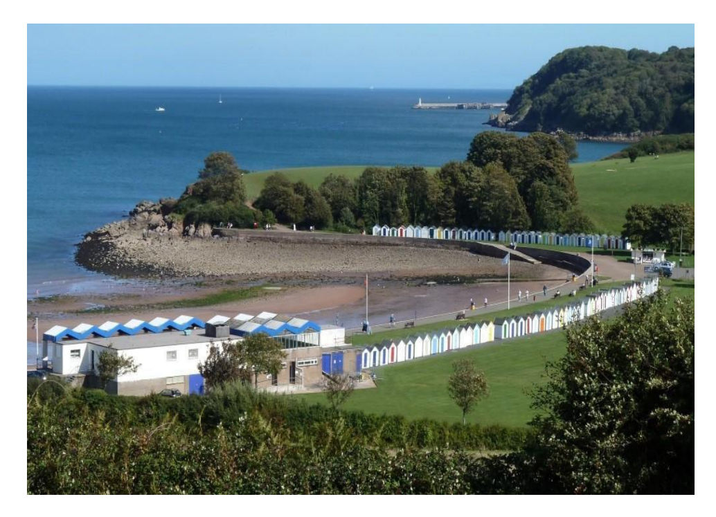
E4-14: Broadsands beach with the Elberry grassy headland behind the row of trees, which leads to Elberry Cove and beach.

E4 – 15: Warborough Common. This area of unmanaged rich calcareous grassland has been Common Land since 1604. It is prized by locals and visitors for its recreational, historical and ecological value, it functions as the gateway to Galmpton. It boasts natural beauty and outstanding views.