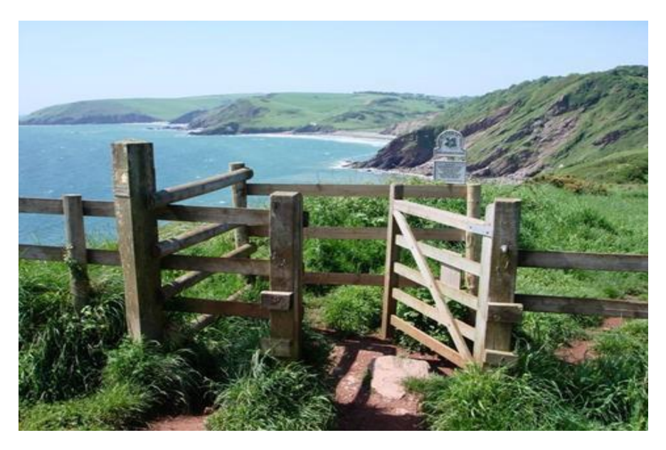
E4 -4: Berry Head National Nature Reserve. Sharkham looking towards Mansands.

E4 – 4: Berry Head. A unique area with many special designations to protect its rare species of flora and fauna of international and national importance as well as its geological status as part of Torbay's "Geopark", its historic siting of two Napoleonic forts that command fine views across Torbay to the north and as far as Portland Bill to the east, ensuring its significance as a SAC in perpetuity. The area includes the SAC, as well as other parts of the AONB which National England suggested be considered for protection after their rejection for housing by this Neighbourhood Plan.