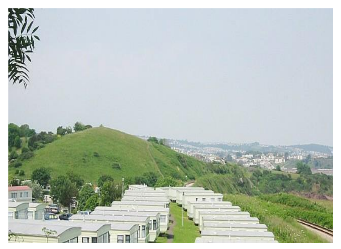
E4 – 17: Sugar loaf Hill and caravans at Waterside.

E4 – 16: Sugar Loaf Hill. A renowned landmark, vantage point and amenity open space situated to the south of Goodrington beach, traversed by the South West Coast Path, and adjacent to the South Devon Steam Railway Line and Saltern Cove Local Nature Reserve (LNR). Its unique conical shape is attributable to its past as a volcanic vent and it sits in a highly important geological area. It is also defined as an Other Site of Wildlife Interest (OSWI) and an Urban Landscape Protection Area (it is bounded by housing on three sides) in the Local Plan.