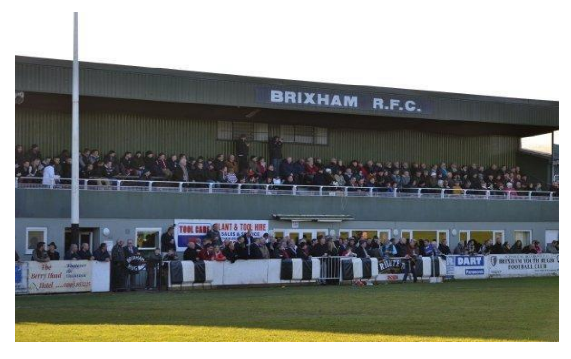
E4 – 2: Astley Park, home to Brixham Rugby Football Club.

E4 – 3: Battery Gardens. A site of great historical importance as well as aesthetic, natural and ecological value, home to the Brixham Battery Heritage Centre and coastal defences built in 1940. The whole area also commands stunning views across Torbay and to the west to Churston Cove to which it connects via the South West Coast Path.