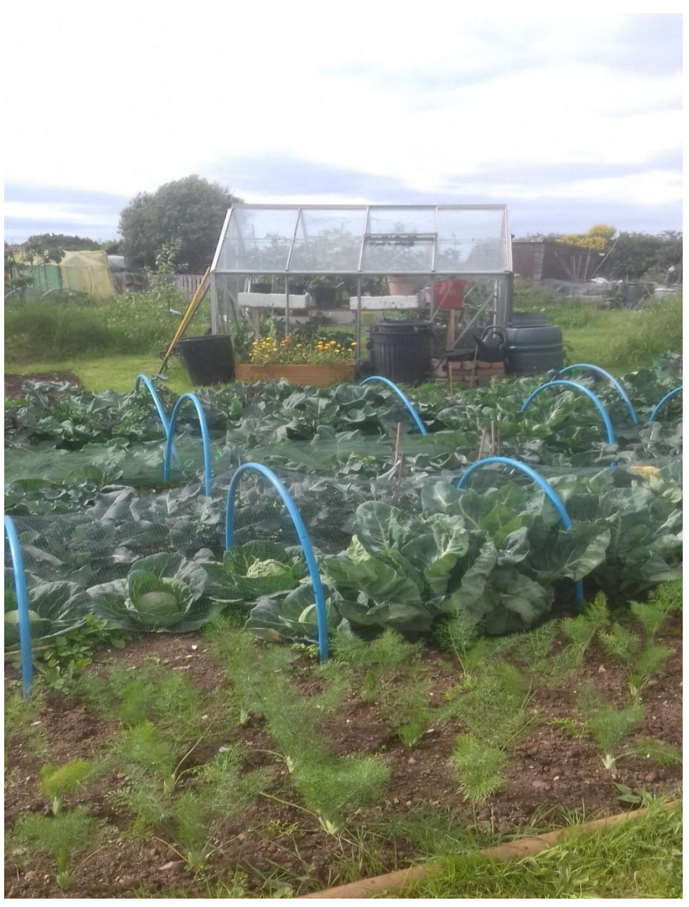
E12 – 4: Stoney Park Allotment Gardens.

E4 – 12: Stoney Park Allotments. Founded by a charity set up in 1912, this allotment for "The Labouring Poor" of Brixham has been managed ever since by trustees of the Charity. While the primary purpose of the site is vegetable growing with approx. 50 plots (a waiting list currently exists), the site also contains a wide range of "microhabitats", including hedges, dry stone walls and two ponds.