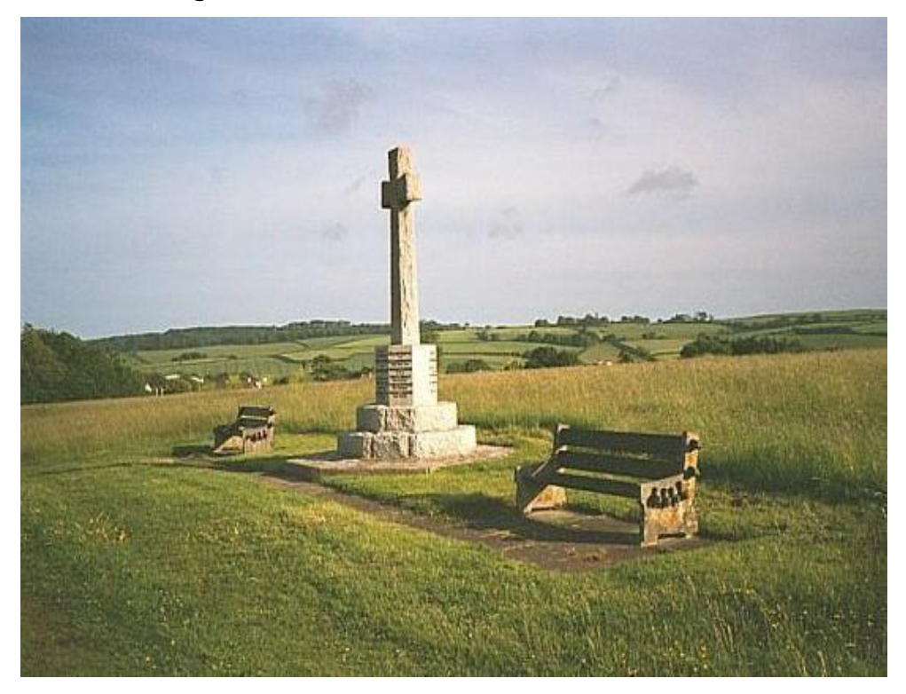
E4 – 15: Galmpton Warborough Common and the War Memorial.

E4 – 15: Warborough Common. This area of unmanaged rich calcareous grassland has been Common Land since 1604. It is prized by locals and visitors for its recreational, historical and ecological value, it functions as the gateway to Galmpton. It boasts natural beauty and outstanding views.