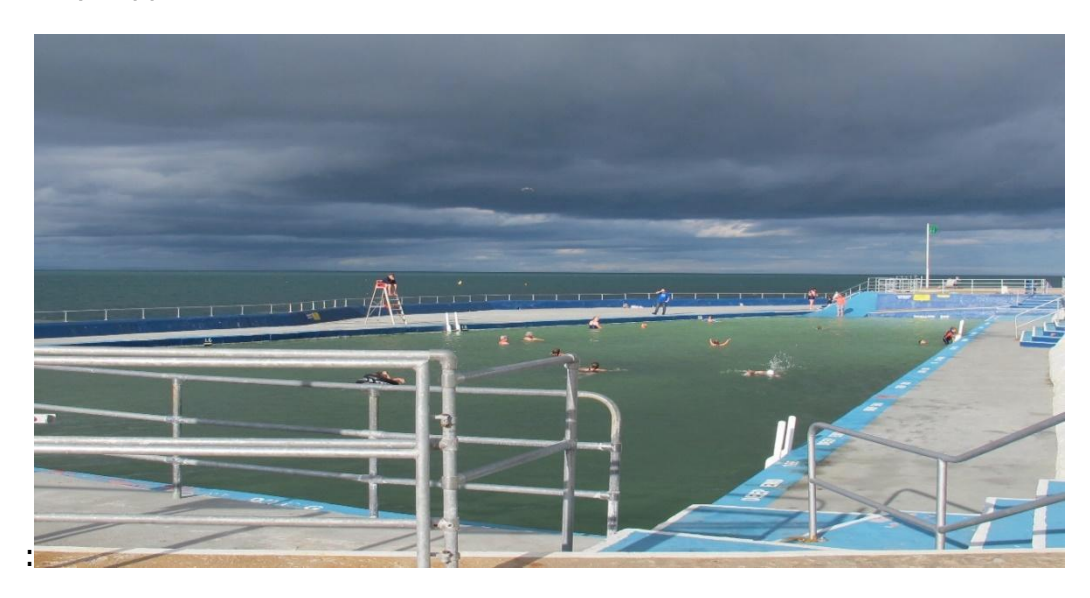
E4 – 9: Shoalstone Pool.

E4 – 9: Shoalstone. This area surrounds a stunning "Art Deco" icon of the South Devon coastline, Shoalstone Pool. This has been a much used recreational amenity for locals and visitors alike since its construction in 1926. Throughout its history, its survival has been entirely dependent on practical and financial support from generations of local communities, none more than today where its very existence owes itself to massive community support.