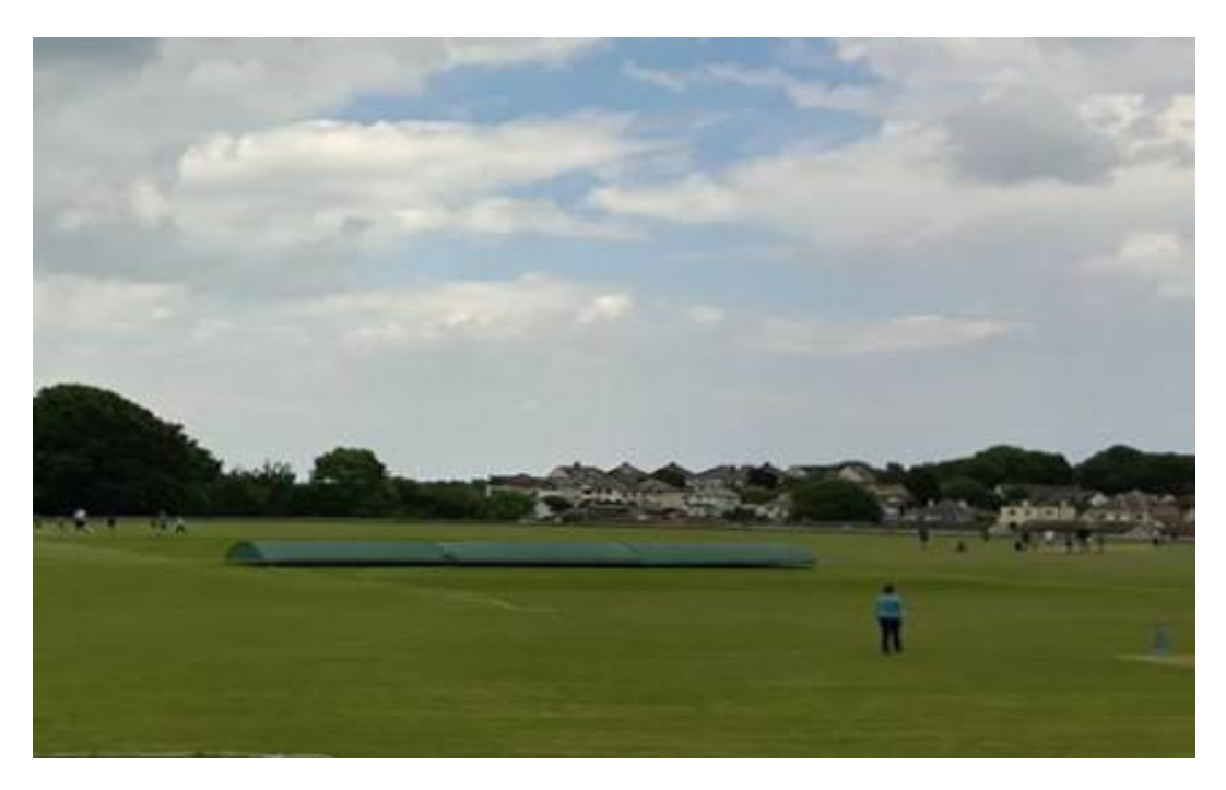
E4 – 6: Brixham Cricket Club Ground.

E4 – 6: Brixham Cricket Ground. Occupying a unique location on specially levelled ground, a scarce resource in or around the Town Council boundary, the new home to a thriving cricket club which was founded in 1934. Its facilities are used by local schools and youth organisations as well as match play, the ground also being used for family fun days and other community activities.