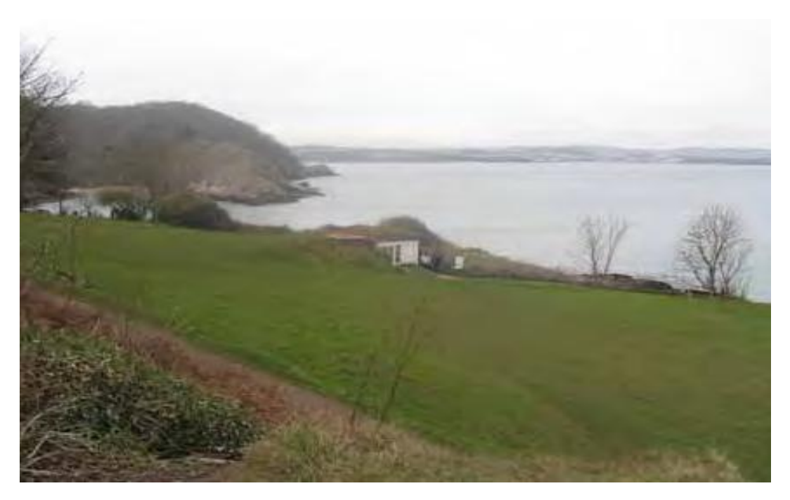
E4 –3: Battery Gardens.

E4 – 3: Battery Gardens. A site of great historical importance as well as aesthetic, natural and ecological value, home to the Brixham Battery Heritage Centre and coastal defences built in 1940. The whole area also commands stunning views across Torbay and to the west to Churston Cove to which it connects via the South West Coast Path.