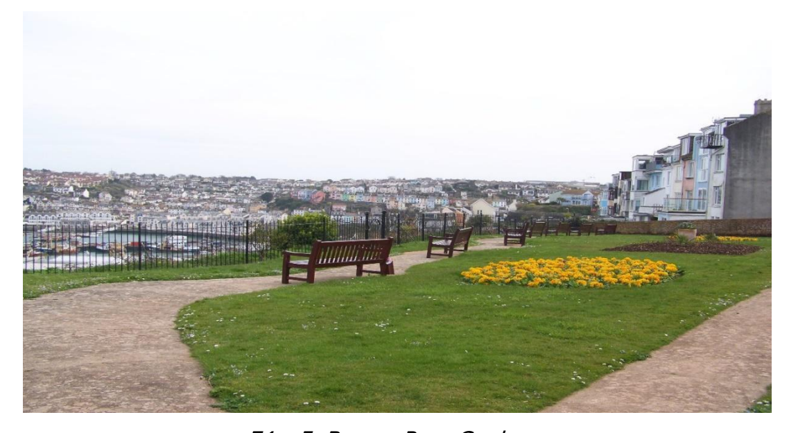
E4 – 5: Bonsey Rose Gardens.

E4 – 5: Bonsey Rose Gardens. A small area of cultivated garden treasured by all due to its cliff-edge position which commands incomparable stunning views across Torbay.