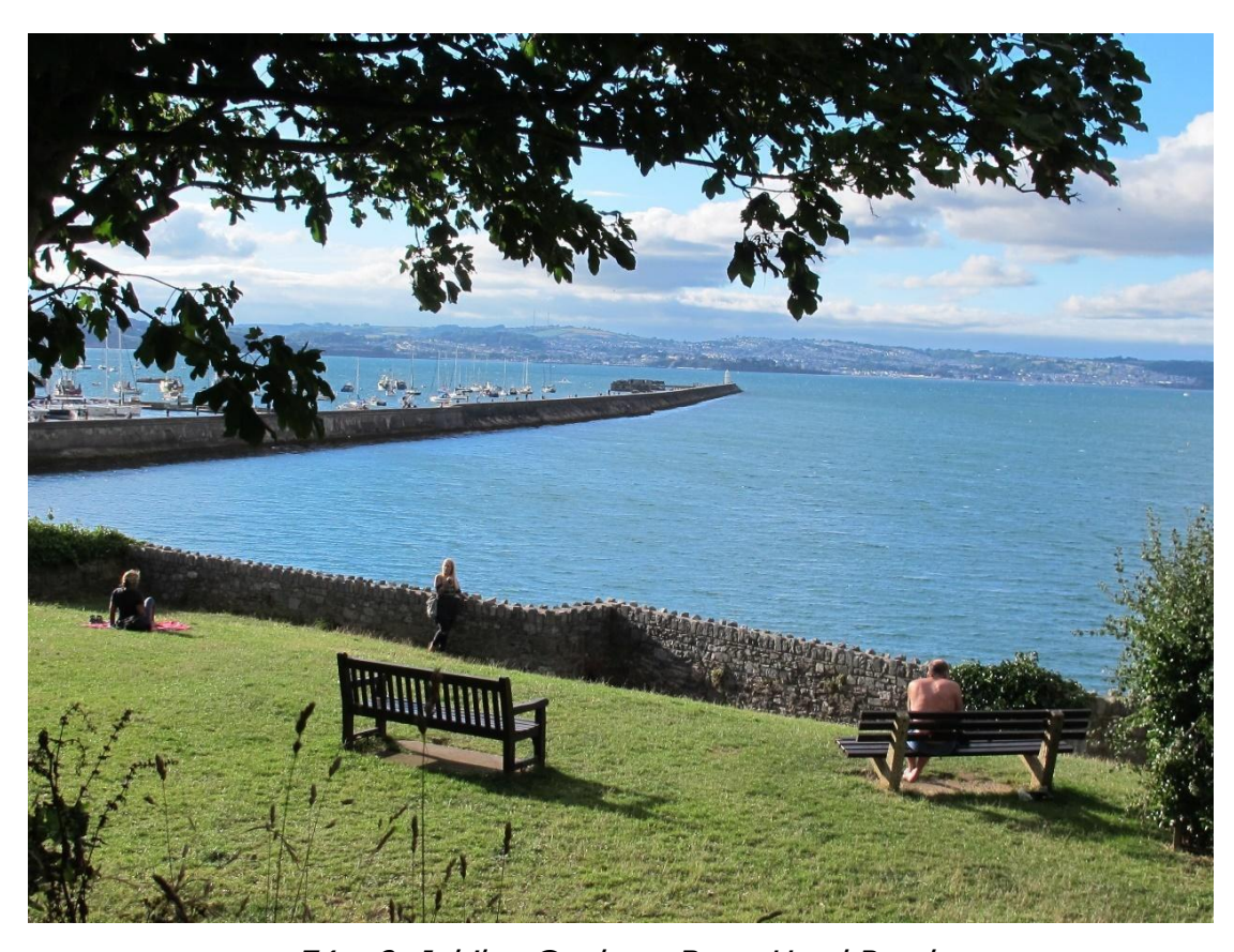
E4 – 8: Jubilee Gardens, Berry Head Road.

E4 -8: Jubilee Gardens. Commanding irreplaceable panoramic views across the Bay, this small area of garden is much used by tourist and resident alike as an enclave of peace and tranquillity in close proximity to Breakwater Beach and the Ranscombe area of the town.