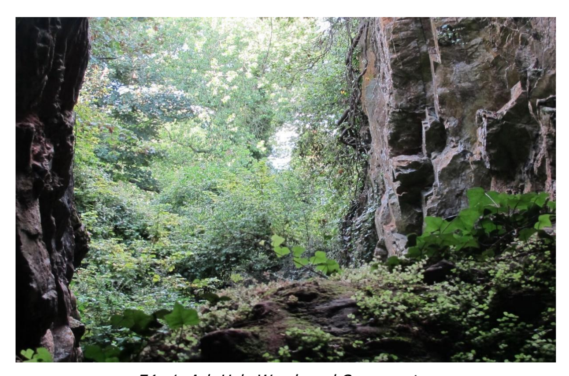
E4 −1: Ash Hole Woods and Cavern entrance.

E4 – 1: Ash Hole Woods. A small woodland area which encloses the entrance to Ash Hole Cavern, a Devonian period limestone cave of great archaeological and geological importance. As such the cavern itself was designated as a Scheduled Ancient Monument (No 33206), and the surrounding woodland designated as an Urban Landscape Protection Area in light of its unspoilt character and conservation interest. It is of importance as a buffer between the built-up areas and the designated Berry Head coastal landscape and is of ecological significance.